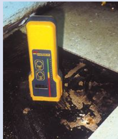
Photo 9: Moisture meter measuring moisture content of plywood subfloor