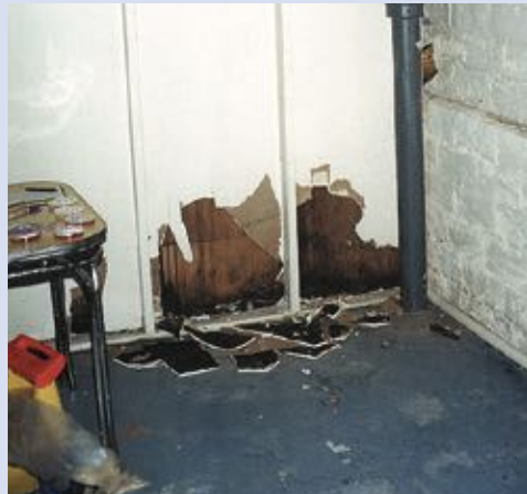
Photo 3B: Front side of wallboard looks fine, but the back side is covered with mold