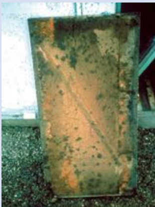
Photo 4A: Contaminated fibrous insulation inside air handler cover

Do not run the HVAC system if you know or suspect that it is contaminated with mold. If you suspect that it may be contaminated (it is part of an identified moisture problem, for instance, or there is mold growth near the intake to the system), consult EPA's guide Should You Have the Air Ducts in Your Home Cleaned? 4 before taking further action (see Resources List).