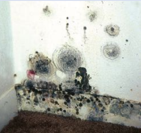
Photo 3A: Mold growing in closet as a result of condensation from room air