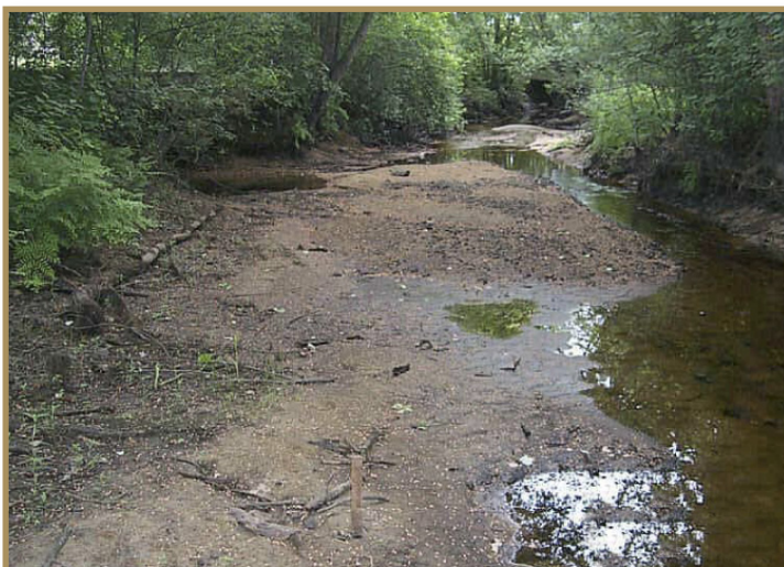
The Ipswich River

Communities facing some or all of these problems can benefit from Water Resource Management Planning. Water Resource Management Planning enables cities and towns to select the most environmentally appropriate and cost effective means of meeting their wastewater, drinking water and stormwater management needs.