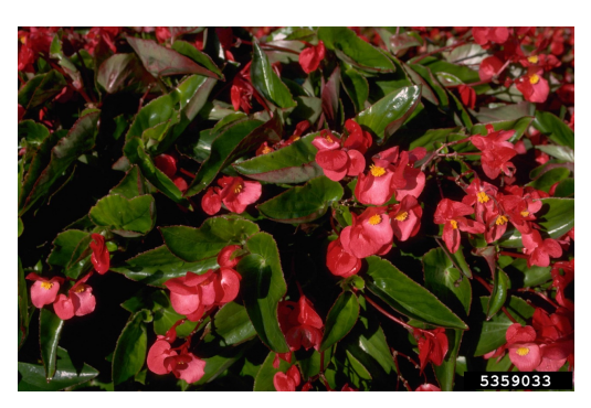
Hardy Begonia ( Begonia spp.).