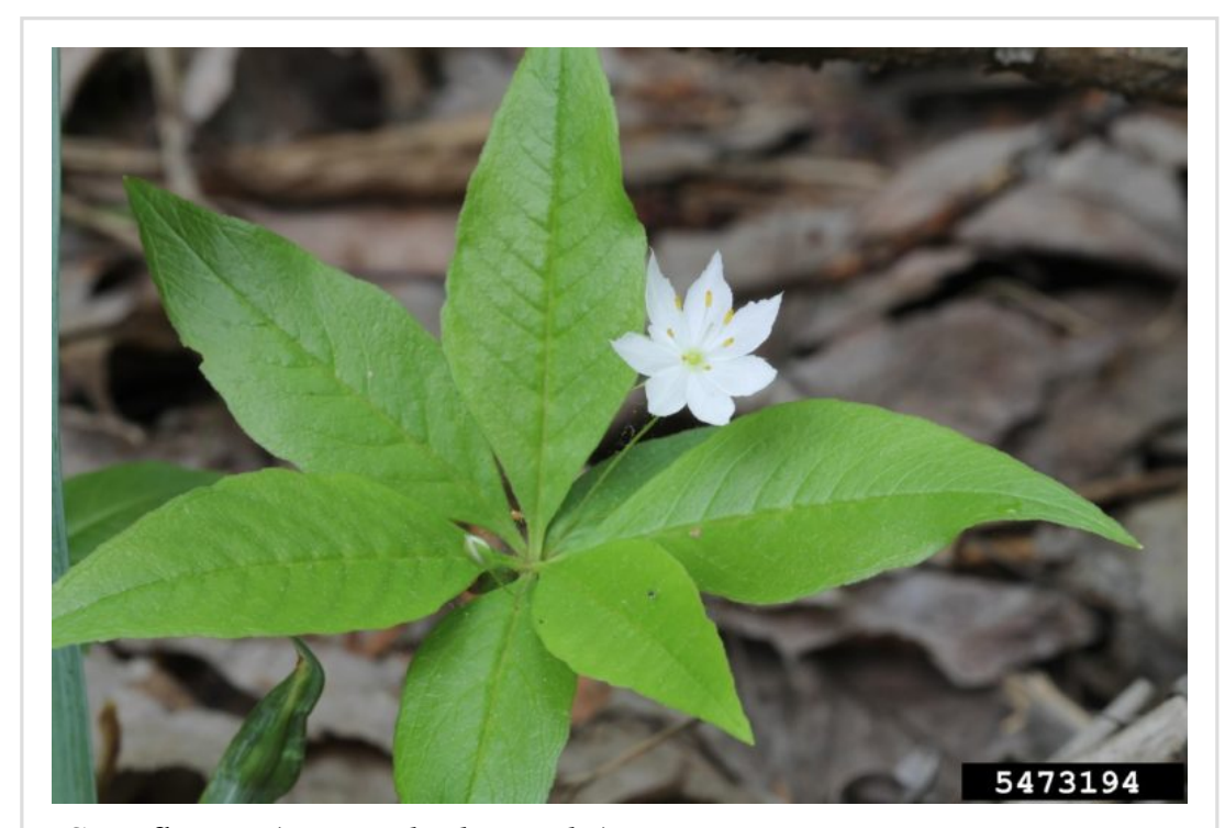
Star-flower ( Trientalis borwalis ).

normal rainfall amounts for the area are best suited for use in a drain field planting. Plants that have aggressive, woody, waterloving, deep roots can potentially clog or disrupt the pipes in the system, causing serious damage that can be very expensive, very messy and threaten the environment. The key is to select plants that will satisfy landscaping needs while posing as minimal a threat to the drain field as possible.