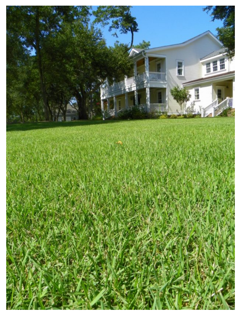
Zosia Lawn. N.C. Corporative Extension

landscape the drain field may also be that it is the only sunny location on their property. This is often the case with new developments carved out of woodland areas. It may also be that the drain field is in the front yard, and the homeowner wants to plant a landscape to accentuate the front of their house. While these are certainly valid considerations, it should be noted that planting certain types of vegetation on or near a drain