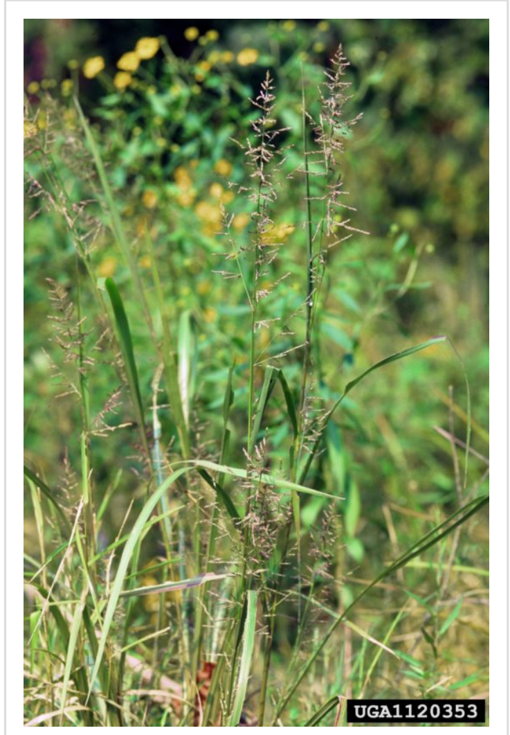
Switchgrass ( Panicum virgatum).

Herbaceous plants, such as annuals, perennials, bulbs and ornamental grasses are generally the