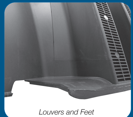
Louvers and Feet