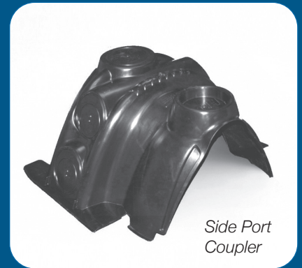
Side Port Coupler