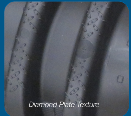
Diamond Plate Texture