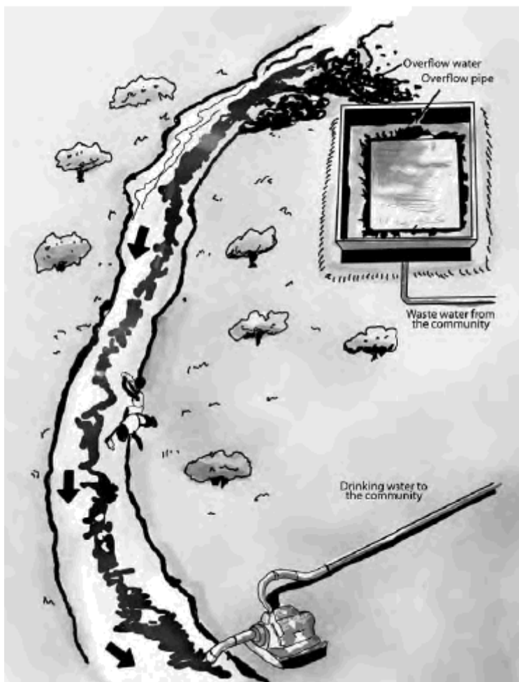
Fig. 2.41: This is how the overflow from sewage lagoon contaminates the community drinking water supply. This is the wrong way.