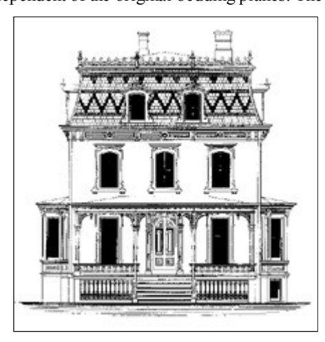
Front elevation of a dwelling published in Supplement to Bicknell's Village Builder . A specification for one of the designs included this direction for the French roof: "Slate the sides of the roof with slate 5 x 12 inches, cornered as shown on elevation, nailed with galvanized nails; all hips and valleys to be flashed with tin in the best manner."

Slate has been used as a roofing material in Europe for hundreds of years, with surviving examples dating to the 8th century. From the 17th to the 19th centuries, most of the roofing slate used in America was imported from North Wales, where slate quarrying was a major industry. Although the first commercial slate quarry in the United States was opened in 1785 in Peach