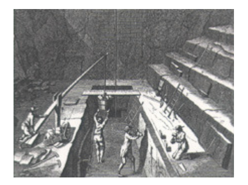
Mineralogie, Ardoises D'Anjou. Travail de la Carrierre Ouverte et Outils. Revuell de Planches, sue Les Sciences, Les Arts Liberaux, et Les Arts Mechaniques, Avec Explication, Diderot-D'Alembert. [click image for larger view]

Until the 1870s the quarrying of slate changed little from what is illustrated by Diderot in the Pictorial Encyclopedia of Science Art and Technology of 1762. Blocks were separated from the floor of the quarry using picks, wedges, prybars and gunpowder, taking maximum advantage of the natural seams in the rock. Windlasses and simple cranes employed man or horse power to lift blocks of slate from the pit. With the Industrial Revolution came mechanical drills and steam-powered stone channeling machines and hoists. Waste associated with blasting was reduced and efficiency increased. Subsequent advances were marked by the introduction of the wire saw in 1926 and the diamond belt saw in 1988.