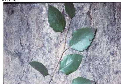
Robert H. Mohlenbrock. USDA SCS. 1989. Midwest wetland flora: Field office illustrated guide to plant species . Midwest National Technical Center, Lincoln. Usage Requirements .

Click on the image below to enlarge it and download a high-resolution JPEG file.