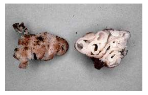
Fig. 3. Peziza whitei , fruiting body 2.5 cm, cut in half to show the folded inside, lined with a layer of asci and paraphyses.

Ascomycete truffles (the "true truffles") can be defined as producing fruiting bodies below or at ground level and having asci without a mechanism for forcible spore discharge. Above ground fruiting bodies of cup-fungi are typically open, discto cup-shaped (Fig. 1) and the spores are