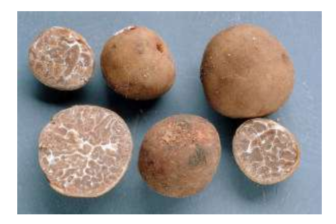
Fig. 4. Tuber rufum , fruiting bodies, 1-3 cm., asci randomly imbedded in dense, firm tissue, with lighter colored sterile veins.

Underground fruiting bodies are closed or nearly closed spherical structures. There is a continuous variation from truffles with a single cavity lined with asci and paraphyses in a palisade, often with a single opening (e.g. in Genea and Hydnotrya ; Fig. 2), to truffles with intricate folding (e.g. in Peziza whitei and Amylascus ; Fig. 3) or with pockets of asci in a firm, solid tissue (e.g. in Tuber ; Fig. 4). The asci range from those that resemble asci of above ground species, being