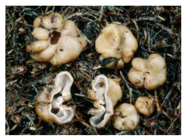
Fig. 2. Fruiting bodies of Hydnotrya michaelis , 3-4 cm in diam., hollow with an apical opening, two fruiting bodies cut open to show the single cavity lined with asci and paraphyses in a palisade.

(Glaziellaceae, Discinaceae, Helvellaceae, Tuberaceae, Pezizaceae, and Pyronemataceae). The only family left with strictly underground fruiting is Tuberaceae. Thirty-eight truffle genera (or genera including truffles) are currently recognized within the Pezizales (Læssøe and Hansen, in review).