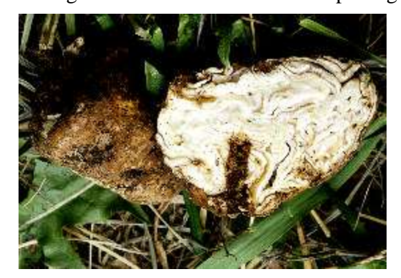
Fig. 5. Geopora cooperi , fruiting body 5 cm. diam., remains closed, cut surface showing inside of folded walls.

Species with intermediary characters can be found. Sarcosphaera coronaria is an example of a cup-fungus that has nearly become a truffle. It forms apothecia under ground and sometimes opens by a rather small aperture, but since the spores are still actively discharged we consider it a classic cup-fungus.