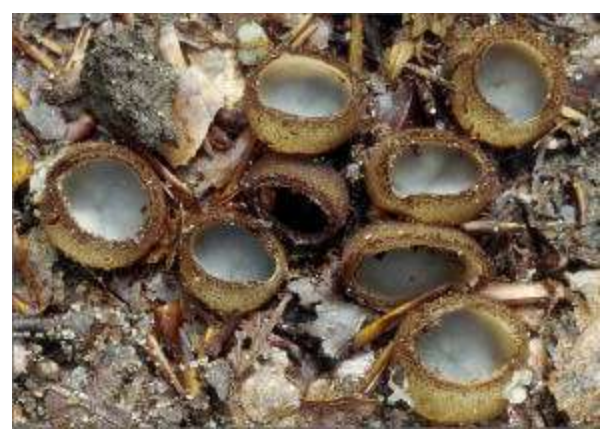
Fig. 1. Humaria hemisphaerica , fruiting bodies 2 cm. in diam., deeply cup-shaped, densely covered on

cytological using and ultra-structural features of asci and spores, and most recently analyses of DNA sequences.