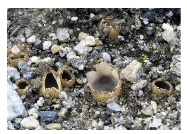
Fig. 6. Geopora sp., fruiting bodies 1-1.5 cm diam., at first globose, closed, underground or almost so, but opens at maturity, splitting into vertical rays, to actively disperse spores. Outside covered with brownish hairs.

cup-fungus Humaria hemisphaerica (Fig. 1) was shown to be closely related to Genea. This is supported by the arrangement of the cells in the fruiting bodies and of the hairs on the outside. Once a fruiting body does not open fully, relaxation of selection for forcible spore discharge may permit loss of some or all of the accompanying morphological traits, such as the loss of the operculum and / or loss of the arrangement of the asci in a palisade. Highly derived truffles occur in Tuberaceae (for example Tuber ) but also in the Pezizaceae with Terfezia and Tirmania being closely related to typical above ground species of Peziza. Species of Tuber are among the most highly prized edible fungi, with the Piedmont white truffle (Tuber magnatum) and the Périgord black truffle ( Tuber melanosporum ) as the best known. Inhabitants of North Africa and Middle Eastern deserts treasure fruiting bodies of Terfezia and Tirmania, and in the Kalahari Desert, Kalaharituber (Pezizaceae) is collected for consumption. In North America the Oregon white truffle Tuber gibbosum and other species are becoming popular edibles.