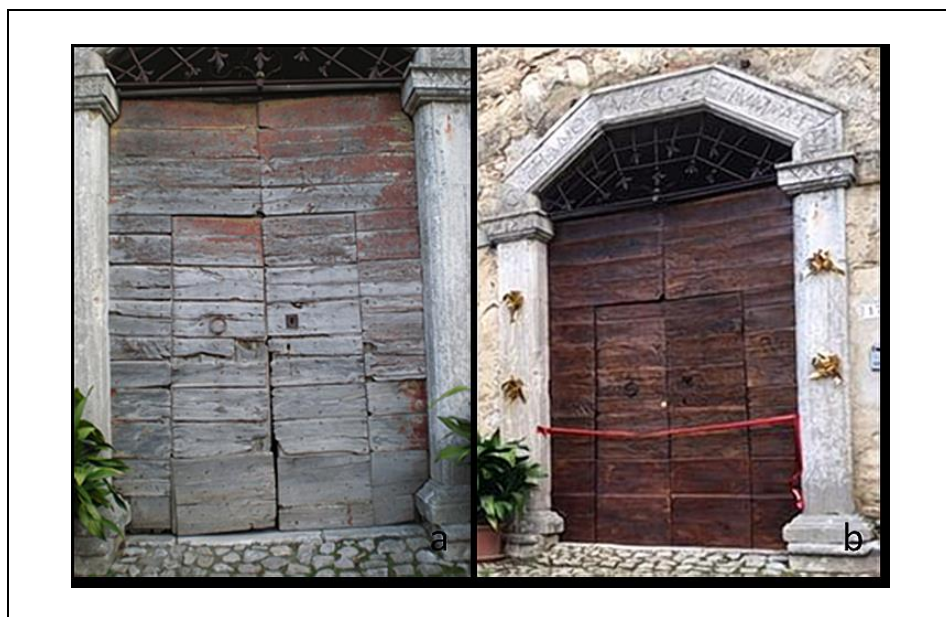
Figure 1. The door in the ex-Abbey of Saint Secondo: (a) before and (b) after the intervention. A smaller door is opened within the main one.

previously ex-Abbey, of Saint Secondo in Amelia, a town in Central Italy, under the district of Terni.