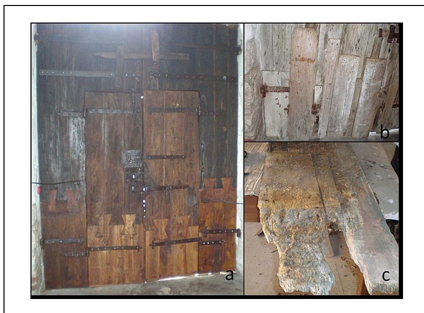
Figure 2. (a) Vertical board assembly in the inner side, after the intervention. (b) Detail of the conservation state before the intervention and (c) decayed boards in the lower zone, inner side, during restoration.