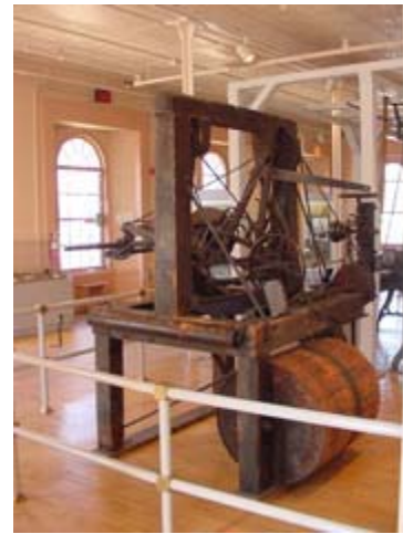
The Blanchard stock-making replicating lathe, built 1822, seen at Springfield Armory NHS