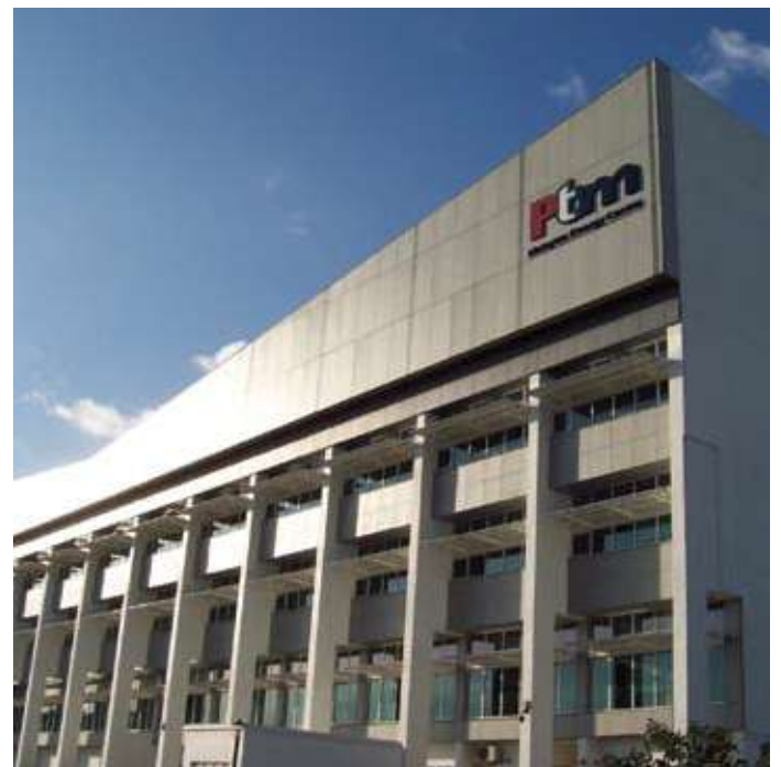
Malaysian Energy Centre Building, Bangi, Malaysia

of the fibres from the lungs. High-alumina, low-silica wool dissipates approximately 10 times faster from the lungs than traditional stone wool (Guldberg et al.; IARC Monograph).