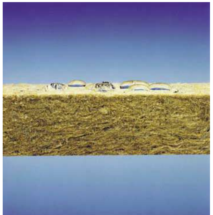
Water-repellent properties of Rockwool stone wool

Moisture and nutrients are necessary conditions for mould growth. Since more than 95% of Rockwool insulation products are made up of inorganic fibres, there is little nutrient source to allow fungal growth. Because of this and the product's water repellence, there is no need to add fungicide (Klamer et al.).