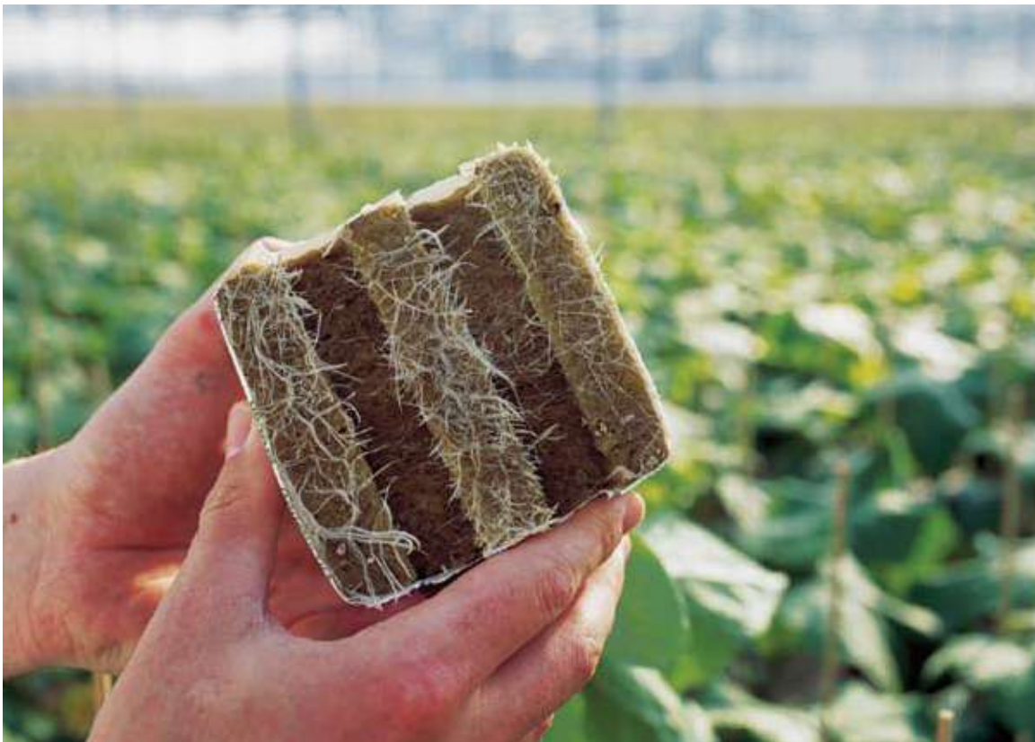
Greenhouse using Grodan® products for growing cucumbers

The Rockwool Group has approximately 8,000 employees in more than 30 countries – and customers all over the world. The group has been producing stone wool for more than 70 years and has currently 21 factories across Europe, North America and Asia (Climate & Environment).