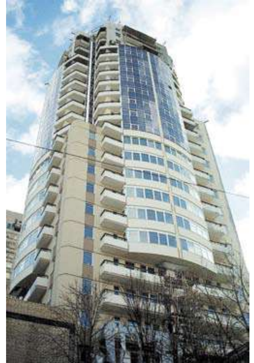
Warsaw, Poland – Rockwool based ETICS solution