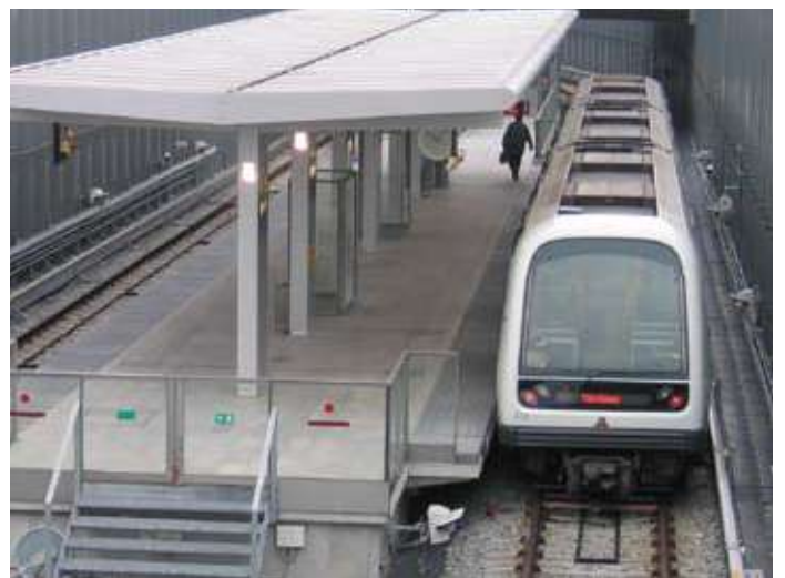
Copenhagen Metro – using RockDelta® anti-vibration mats