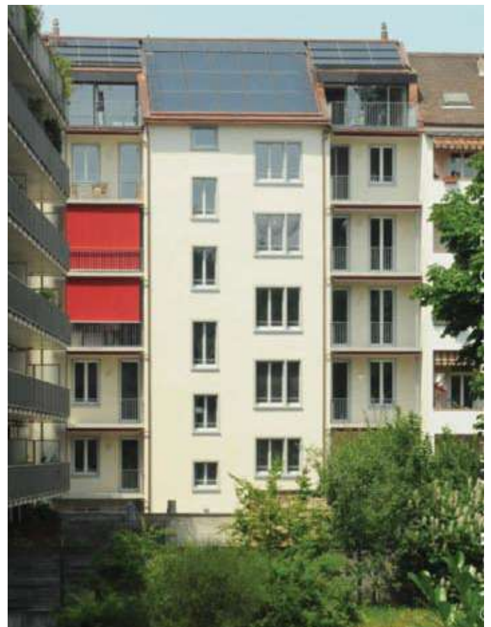
Renovated multiple family home, Basel, Switzerland (Viridén + Partner AG, Zurich)

As the name implies, measures necessary to achieve a Passivhaus are mainly passive. Once installed, they perform throughout the lifetime of the building without needing maintenance, except for a change of ventilation filter once or twice a year.