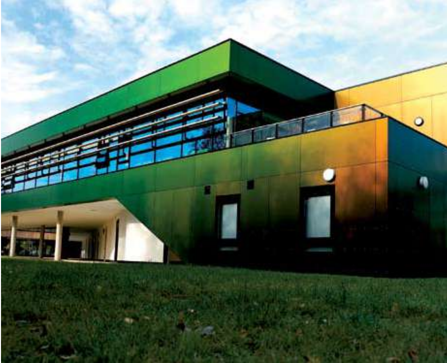
Innovation Centre Lincoln, UK equipped with Rockpanel® chameleon cladding