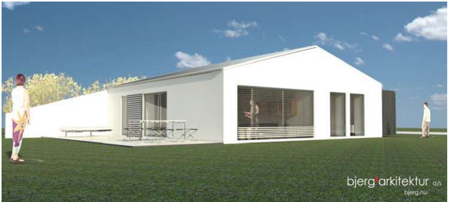
Passivhaus, Hjørring, Denmark