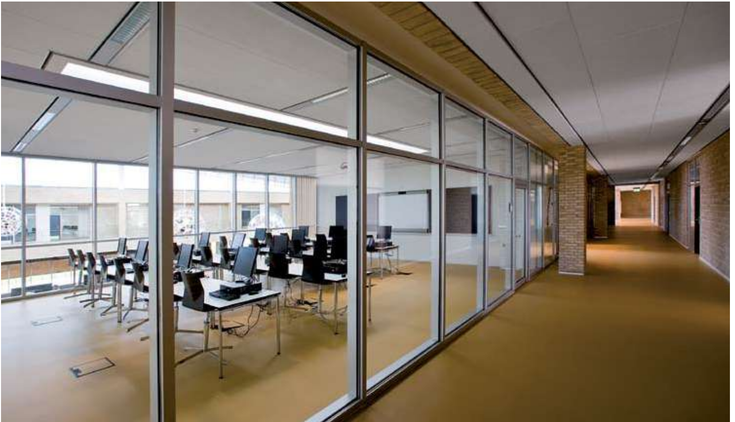
Classroom at A.P. Moller School, Schleswig, Germany, using Rockfon® ceiling tiles

A good wall construction using Rockwool insulation will help reduce noise transmission by more than 50 decibels (dB) – approximately 20 dB more than a construction without insulation. To put this in context, to humans, a 10 dB difference is heard as a doubling (or halving) of the audible sound (Climate & Environment).