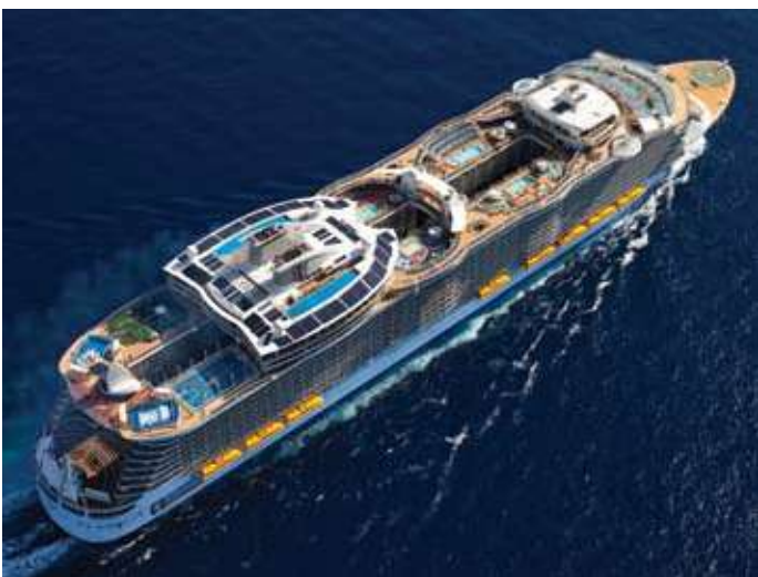
Oasis of the Seas – insulated with stone wool