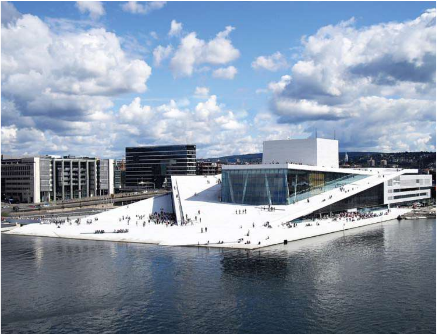
Oslo Opera House – using Rockwool stone wool