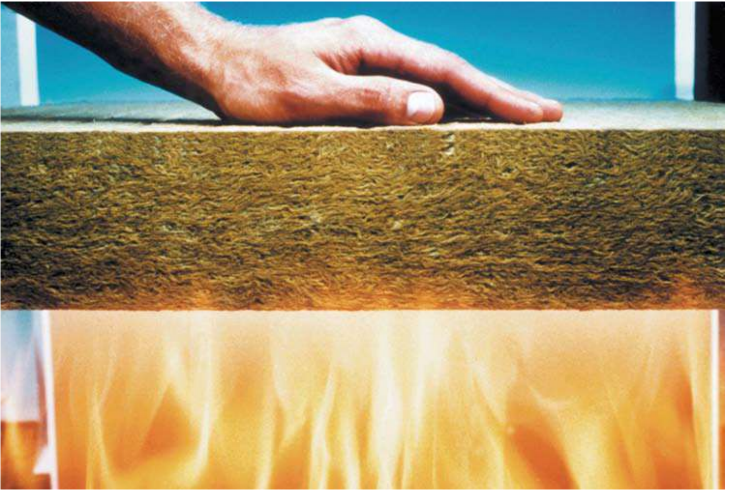
Fire-retardant properties of Rockwool stone wool