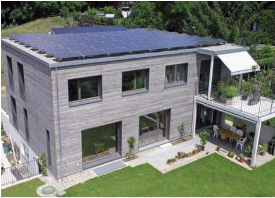
Newly built double family house, Riehen, Switzerland (Setz Architektur, Switzerland)

Two examples from Switzerland illustrate even further reductions in energy demand. The first example from Basel shows how a multiple family home was renovated so that it needs zero energy for heating, hot water and air ventilation system with heat recovery.