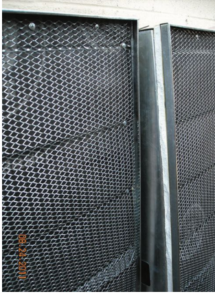
Picture showing lath applied to the wall with v-groove self-furring and weather-resistant barrier behind the lath. The fasteners are attached into the groove and spaced at proper widths to achieve ASTM C-1063 installation standards.

Proper lath installation is of equal importance to the longevity of plaster-based building exteriors. Below are some of the most common lath-related installation errors and how they can be avoided.