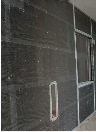
Metal lath attached to wall with PVC accessories.