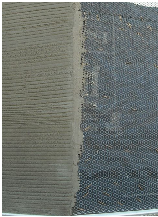
Illustration of a corner application, showing lath applied with scratch-coat on the left, and lath applied around the corner over two layers of weather-resistant barrier, consisting of synthetic wrap over Grade D paper.

The accessory material selected for a particular expanded metal lath application depends largely on the climate of the building's location, along with the type of plaster/stucco or stone application used to form the façade. For instance, the higher humidity and salty air of coastal environments often demands a higher zinc alloy, or possibly PVC, for exterior skin components. However, in drier climates, galvanized accessories are more acceptable. Specifiers should note though, there may be trade-offs with certain materials. For example, while zinc alloy offers greater corrosion resistance, the material is considerably softer than galvanized steel. And, while PVC accessories are non-corrosive, they may not fit the building owner's aesthetic preferences. Another important thing to remember is that grouping incompatible materials in the final specification of lath, fasteners and accessories can increase the possibility of galvanic corrosion (i.e., electrolysis) or inconsistent corrosion protection, which threatens the stability of the building's cladding.