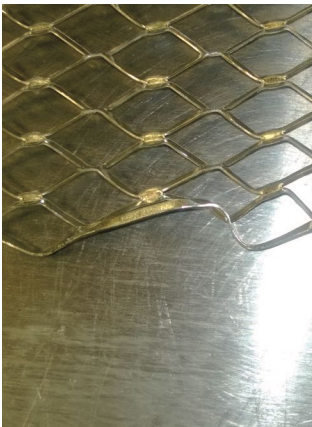
This illustration shows where the lath product has crimped on the ends due to cutter-tooling wear.

In general, the manufacturing of expanded metal lath begins when a small (< 12 inches) G-60 galvanized steel coil (meeting ASTM A653) is gradually uncoiled and fed into the cutting rollers of a large rotary expanding machine. The cutting rollers apply a force of more than 100,000 pounds (445 kN) to slice through the sheets, creating the diamond configuration. Stretcher arms on the machine attach to the coil and expand the sheet into compacted diamond-pattern sheets, 27 inches (696 mm) in width. The machine will have a sheet end cutter that can be set to various lengths—typically, 97 inches (2,464 mm) is the minimum length for packaging as a standard sheet, per ASTM C847-10 requirements. Manufacturers are required to maintain cutting rollers to ensure clean cuts and prevent formation of unexpanded diamonds or the fracturing of diamonds in configuration (see photo left).