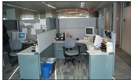
Figure 2: Open plan office with one floor diffuser per workstation.

rate), and individual preferences. As an example of the variations, a person walking continuously around in an office (1.7 met [99 W/m 2 ]) will experience an effective temperature of the environment that is approximately 3°F–5°F (2°C–3°C) warmer than a person sitting quietly at their desk (1.0 met [58 W/m 2 ]), depending on clothing level.