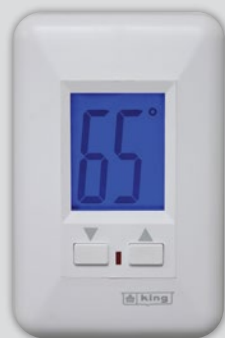
ES120 ES230 Non Programmable