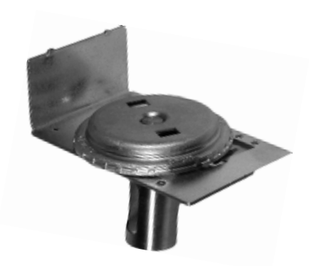
Zone Valves Assemblies