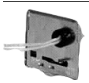
Zone Valves Replacement End Switch

• Replacement end switch for V8043 zone valves (new style 1978 up)