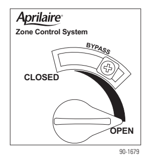
Preset Adjustable Stop Position