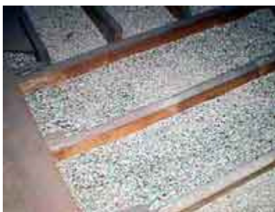
Photo - Attic Containing Vermiculite Insulation -