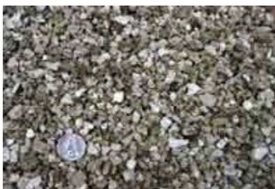
Photo - Vermiculite Insulation -

Vermiculite is a naturally occurring mineral that has the unusual property of expanding into worm-like accordion shaped pieces when heated. The expanded vermiculite is a light-weight, fire-resistant, absorbent, and odorless material. These properties allow vermiculite to be used to make numerous products, including attic insulation.