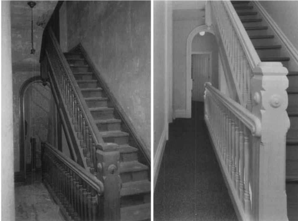
A large-scale historic rehabilitation project incorporated sensitive lead-hazard reduction measures. Interior walls and woodwork were cleaned, repaired, and repainted and compatible new floor coverings added. The total project was economically sound and undertaken in a careful manner that preserved the building's historic character. Before:left, after:right.

In 1978, the use of lead-based paint in residential housing was banned by the federal government. Because the hazards have been known for some time, many lead components of paint were replaced by titanium and other less toxic elements earlier in the 20th century. Since houses are periodically repainted, the most recent layer of paint will most likely not contain lead, but the older layers underneath probably will. Therefore, the only way to accurately determine the amount of lead present in older paint is to have it analyzed.