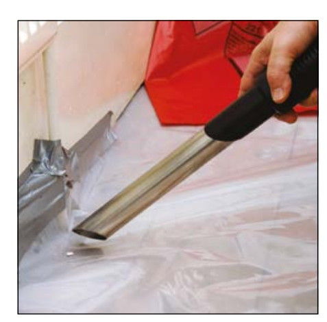
Vacuum clean carefully. It is easy to disturb asbestos fibres, make them airborne and breathe them in