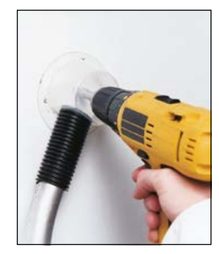
Control measures: shadow vacuuming and using a drill cowl as local extraction