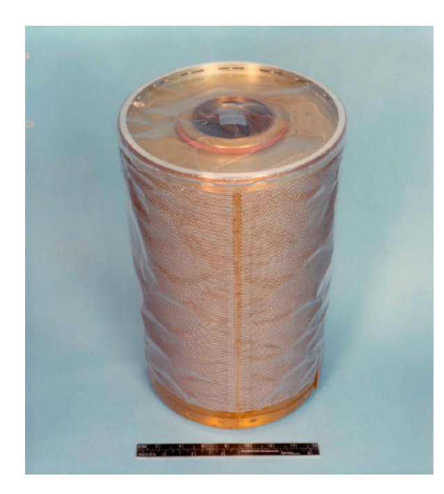
Figure 2. US LiOH canister on ISS and Shuttles.

Two methods are employed in controlling CO_2 levels in manned spacecraft – adsorption and chemical reaction. During the NASA's Mercury, Gemini, and Apollo Programs, the carbon dioxide removal systems used lithium hydroxide (LiOH) canisters.<sup>9</sup> In the presence of water, CO_2 reacts with lithium hydroxide to form the more innocuous compound, lithium carbonate. In these vehicles, two canisters of lithium hydroxide pellets were mounted in a parallel configuration. However, operationally, only one canister was used at a time. As the lithium hydroxide in the canister was depleted, the air-flow was diverted to the second canister and the first canister replaced. Due to the simplicity and effectiveness of the lithium hydroxide-based CO_2 scrubbing system, a very similar system was adopted for use on the Space Shuttles. The CO_2 removal system in Skylab was a complete departure from the previous NASA programs and served as the precursor to the current system used on the ISS. Skylab employed a regenerative CO_2 removal system using canisters of molecular sieves, specifically 5A zeolite, to adsorb CO_2 from the Skylab atmosphere. Two canisters of zeolite were used such that one canister was regenerated by vacuum desorption into space while the second canister removed CO_2 to ensure continuous removal.