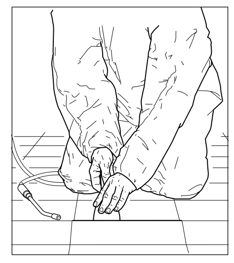
Spray water under the tiles to suppress dust as you lift them gently, avoiding breakage