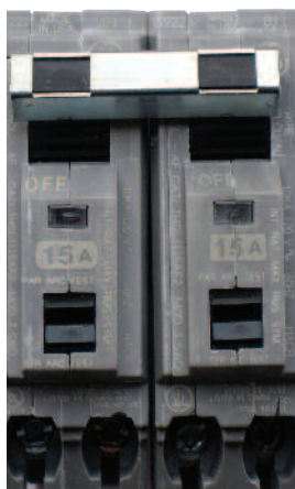
Figure 1. Two 1-pole AFCIs with THT104 handle tie