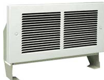
ZA and RA model grill

WHAT TO DO: Consumers should check to see if their heater meets the conditions of this recall by following the directions at Cadet's web site at http://www.cadetco.com/upgrade_program.php#recall . If the heater is part of the recall, stop using it immediately by turning it off at the electrical panel board (circuit breaker or fuse box). Consumers should contact Cadet to schedule a free repair at (800) 567-2613 between 6 a.m. and 6 p.m. PT Monday through Friday. In July 2001, Cadet began directly notifying affected consumers who participated in the October 1997 and February 2000 heater recalls about this RM and ZM program and began arranging service calls.