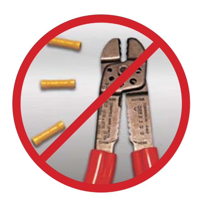
Do Not Use Common Hand-Crimped Connectors with Aluminum Wire

Two other repair methods described below are often recommended by some electricians because they are substantially less expensive than COPALUM crimp connectors. CPSC staff does not consider either of these repairs an acceptable permanent repair.