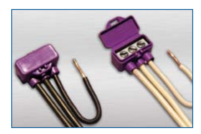
The AlumiConn Connector

CPSC staff recognizes that copper replacement may be cost prohibitive and that the COPALUM repair may be unavailable in a locality. Based upon an evaluation that was, in part, CPSC supported,<sup>5</sup> consumers are advised that, if the COPALUM repair is not available, the AlumiConn connector may be considered the next best alternative for a permanent repair. This repair method involves pigtailing using a setscrew type connector instead of the COPALUM crimp connector in the repaired connections. The AlumiConn connector has performed well in initial tests, but is too new to have developed a significant long-term safe performance history as the COPALUM repair. The repair should be conducted by a qualified electrician because careful, professional workmanship and thoroughness are required to make the AlumiConn connector repair safe and permanent.