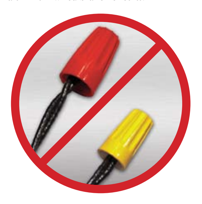
"Pigtailing" with Twist-on Connectors Is Not a Recommended Repair

of twist-on connectors with aluminum wire. It is possible that some pigtailing "repairs" made with twist-on connectors may be prone to even more failures than the original aluminum wire connectors. Accordingly, CPSC staff believes that this method of repair does not solve the problem of overheating present in aluminum-wired branch circuits.