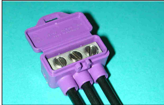
FIGURE 4 - King Innovation "AlumiConn" Connector

In mid-2006 a new connector became widely available for the aluminum wire pigtail application. This connector is shown in Figure 4. Test results for this connector have been published and are publicly available. [13] The CPSC now accepts use of the AlumiConn connector as an acceptable alternative repair method if the COPALUM repair cannot be implemented.