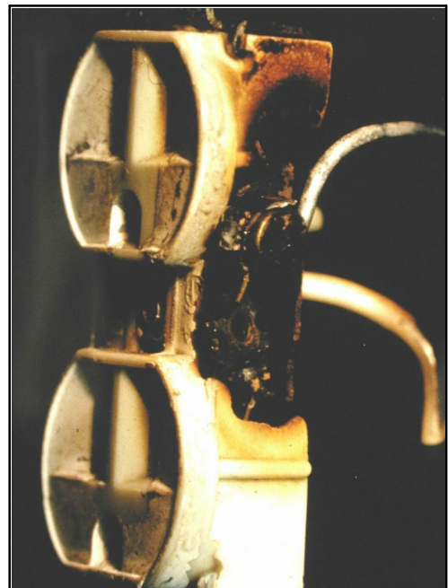
FIGURE 2 - EXAMPLE: OVERHEATING OF ALUMINUM-WIRED TERMINALS ON A RECEPTACLE. Enough heat was generated by current flowing through the aluminum wire connections to cause charring of the receptacle body and disintegration of the insulation that was on the wire. Note that the face of the receptacle, as the homeowner or an inspector would have seen it, with the cover plate on, would look normal.