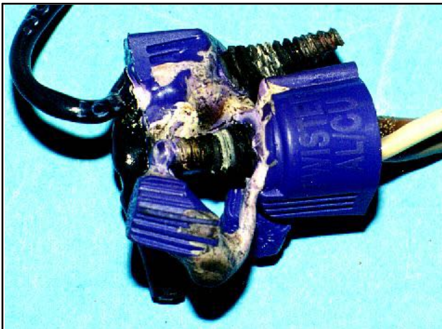
A. These two failed splices are adhered together by the melted plastic insulating shells.

Additionally, field burnouts have now been reported with the Ideal #65 connectors in their rated applications. With CPSC skeptical (and requesting that UL withdraw its listing), the manufacturer initially agreeing that the connector is not for the pigtail retrofit application, independent tests clearly demonstrating poor performance, and field failures reported, the use of the Ideal #65 "Twister" connector for the pigtail application is definitely not recommended. If the COPALUM repair is not available, use the AlumiConn connector (See Section 1C).