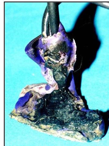
B. Severe failure, plastic shell melted and charred. The charring indicates that it had probably ignited.