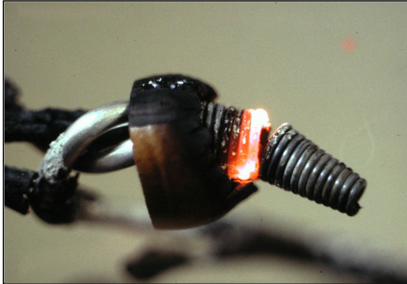
FIGURE 1 - ALUMINUM WIRE SPLICES MADE WITH TWIST-ON CONNECTORS CAN BE DANGEROUS. The use of most types of twist-on connectors with aluminum wire can lead to hazardous results. This twist-on pigtail connection (two #10 aluminum wires with one #12 copper wire, in a 20-amp circuit), made with a twist-on connector that was UL listed for use with aluminum wire at the time, remains electrically functional in the circuit, but it becomes extremely hot whenever a significant amount of current flows. The heat has deteriorated the insulation on both the connector and the wires. In this photo, a portion of the connector's spring is red hot, at current well below the circuit rating.