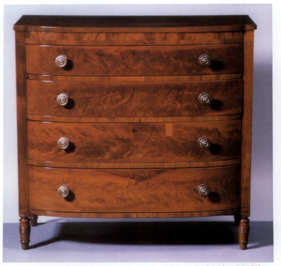
Figure 2. A veneer repair patch, located on the front of the third drawer, has faded from light. This extreme fading is typical of areas where aniline stains have been applied.

damaging to light-sensitive objects and architectural woodwork.