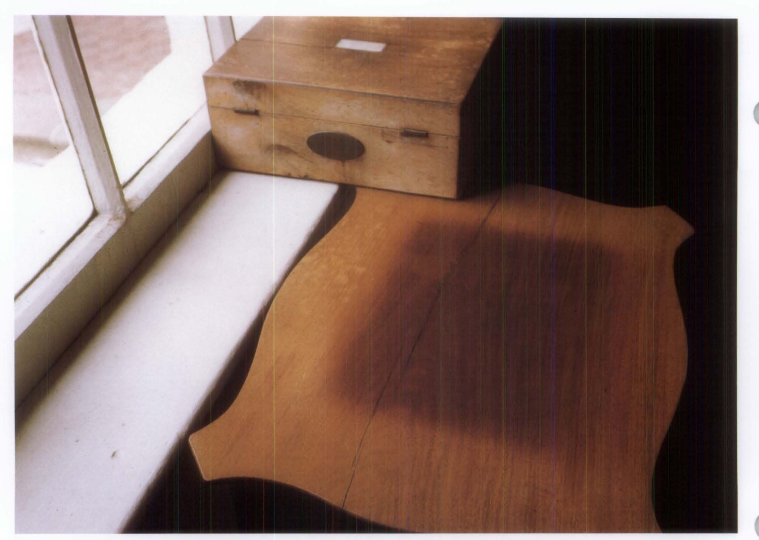
Figure 6. This small table and wooden box should not have been located beneath the window. Light has faded the finish of the table top except in the center, where the box rested and shielded the finish. The finish on the top and back of the box is nearly completely lost.