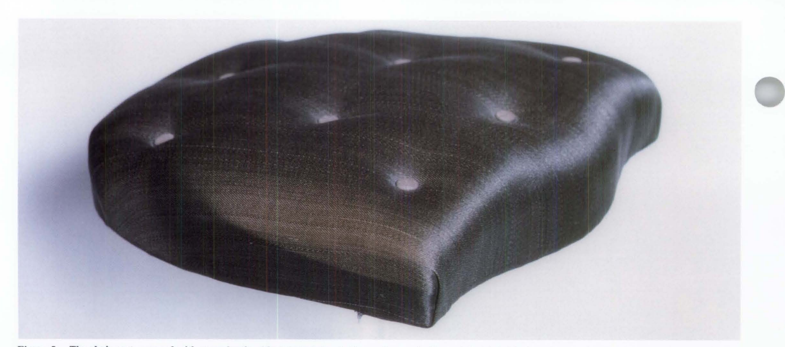
Figure 5. The chair seat, covered with reproduction black haircloth, similar to the one in figure 4, has faded in just eleven years due to exposure to unfiltered natural light. The unfaded (dark) area on the side of the seat was protected from the light by the seat rail of the chair.