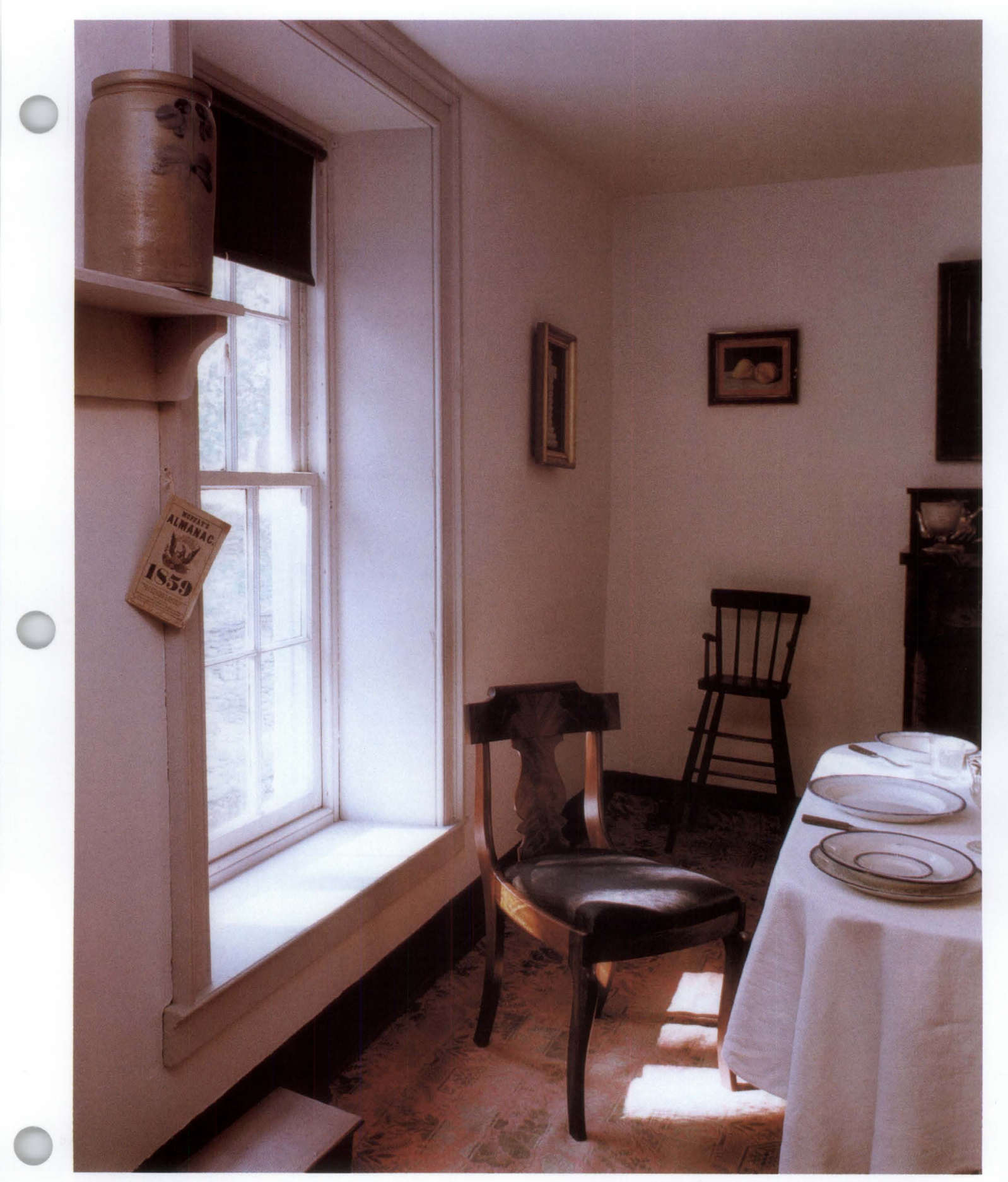
Figure 4. A number of steps can be taken to control or reduce the damage to historic furnishings caused by light entering through windows. In this house museum, a reproduction table cloth is appropriate for use in protecting the mid-nineteenth century dining room table. The chair would be better protected by moving it away from the window. The dark window roller shade should be drawn in this house museum during periods of direct sunlight and when the building is closed to the public.