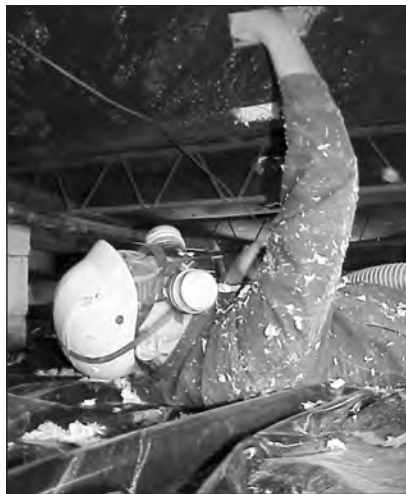
After cutting access holes through the belly board of the mobile home, push any existing insulation aside so that the flexible fill tube can slide the length of the joist cavity for a complete fill.

The West Virginia WAP has recently started to perform electric baseload measures. Compact fluorescent bulbs can be used to replace any incandescent bulb that is on at least two hours per day. Refrigerators can be replaced with