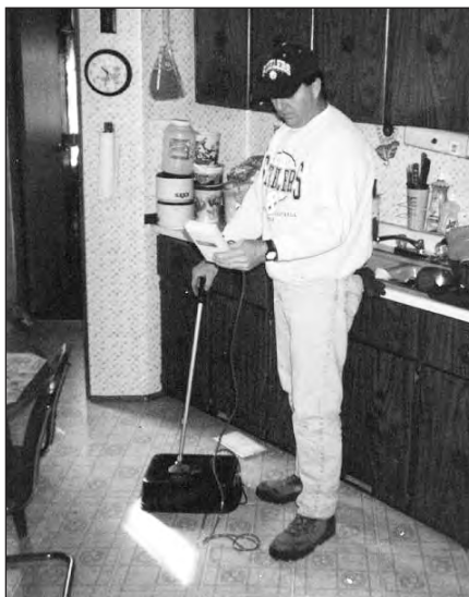
Along with a visual inspection, a pressure pan test is performed.

Place the pressure pan completely over the register opening to form a tight seal. Allow enough time for the reading