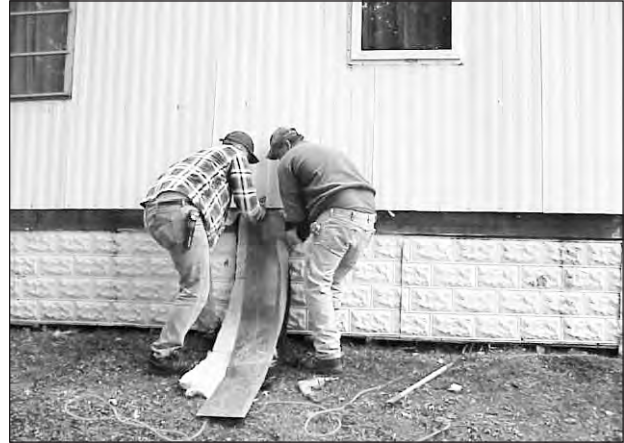
(left) To fill the outer area of the mobile home floor, a muffer pipe is attached to the flexible hose. The natural curve of the pipe makes it easy to rotate the pipe in the cavity to get maximum fill. (right) Batt stuffing is one way to reinsulate the walls of mobile homes. Remove the bottom two rows of screws, and you can stuff the insulation into the cavity using a strong, flexible plastic stuffer.

no significant air leaks into the roof cavity or in the floor.