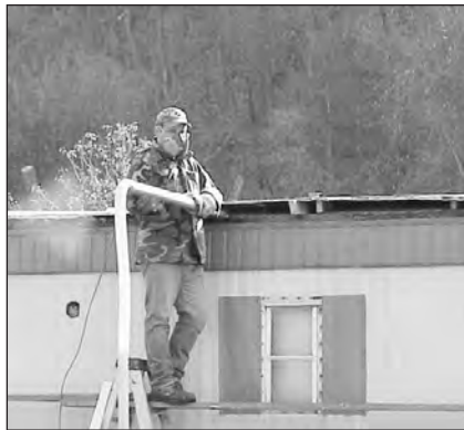
A worker blows fiberglass into the cavity of the mobile home roof. Note the 2 x 4s used as wedges to hold the roof cavity open. A small amount of blowback can be seen.

For both types of floor construction, start at one end and cut a row of access holes in the belly board so that you can insert the blower hose into the joist cavities. If the floor joists run crosswise, cut your holes near the center of the trailer. Usually you will be able to snake the flexible hose to each of the long edges of the home from holes along the center. If the floor joists run lengthwise, cut a row of holes into each joist cavity across the belly. With either construction, fill the cavity from one direction and then from the other. Make sure to fill the entire