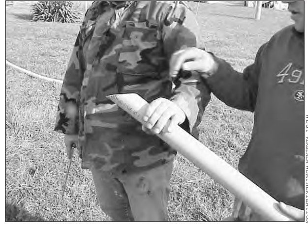
(left) After the duct is cleaned, fibred tape and mastic are used to air seal. A paint brush is the easiest ways to apply the mastic to the duct. (right) The end of the blow tube should be cut at an angle to help the tube slide over the existing insulation and past any obstructions in the cavity.

There are several ways to insulate the area under the floor. The type of construction, and whether or not the underbelly is accessible from underneath, will determine which method is best. In West Virginia, we mostly insulate the floor from the crawl-space underneath the mobile home using blown-in fiberglass insulation.