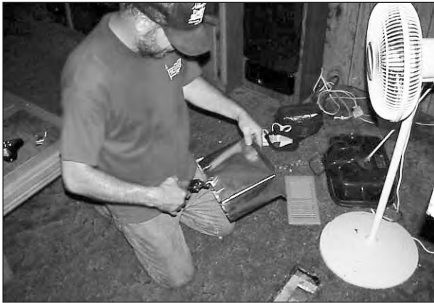
WEST VIRGINIA WEATHERIZATION