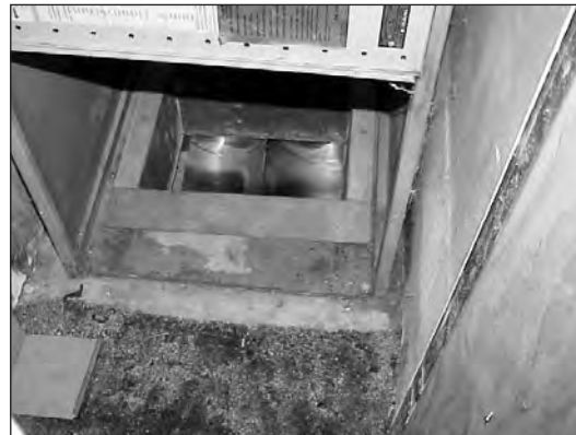
WEST VIRGINIA WEATHERIZATION

Making the heating unit safe and efficient, while important, is only part of making the entire heating system as efficient as possible. The condition of the