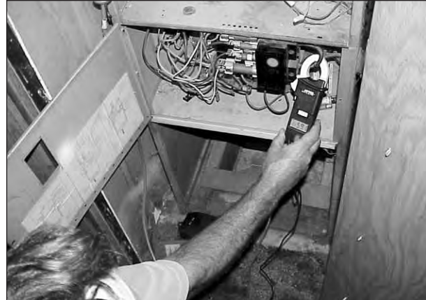
WEST VIRGINIA WEATHERIZATION