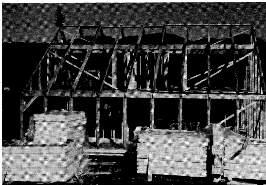
Northern Energy Homes, Norwich, Vt., supplies completely pre-cut house packages using polystyrene panels and a simplified timber frame. On the interior face, Northern Energy uses either pine [cover photo] or drywall backed by waferboard.