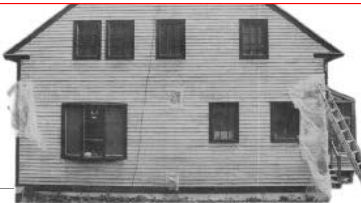
The west face of the house (above) was cut open in four spots, all revealing severe decay of the timber frame and adjoining wood. The southwest corner (below left) and center holes (below right) are shown close up.

The owner confirmed that condensation covered most of the windows for most of the winter. The sources of moisture were many. For the first two years, the house had a wet basement each spring. (This was finally cured by regrading around the foundation.) There were no bathroom or kitchen fans, and the dryer vented indoors. The