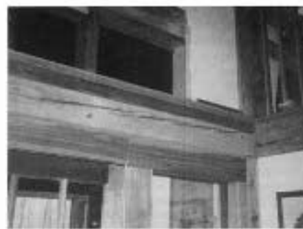
The beams were heavily checked on the inside (right) and rotting on the outside (left).