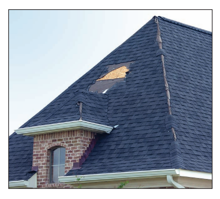
Figure 8-1. Instance where wind pressures exceeded the strength of the asphalt roofing.

Roof systems can also fail if roof-mounted equipment is damaged or dislodged by high winds. During Hurricane Katrina, loss of mechanical equipment caused the majority of water damage that was observed in several buildings. In some of those buildings, structural roof damage itself was quite minimal yet the buildings experienced extensive water damage.