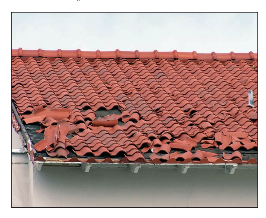
Figure 8-8. Clay tile roof failure. The tiles were dislodged due to inadequate anchorage.

FEMA (and other entities that have conducted post-disaster investigations since Hurricane Andrew struck Florida in 1992) have noted that tile roof coverings have not performed well during several high-wind events. Although performance of these roof covering systems has improved since Hurricane Andrew (due largely to better design and construction guidance from the manufacturers), roof covering systems still frequently fail during hurricanes. The performance of mortar-set tile roof systems continues to be very dependent upon the quality of the installation. This installation method has consistently been observed during MAT investigations to not perform as well as other tile installation methods. Tiles also remain vulnerable to being damaged by windborne debris because they are considered brittle coverings. When clay or concrete tiles are impacted by windborne debris, they commonly break and leave the underlayment exposed to high-wind forces it was not designed or constructed to resist (see Figures 8-8 and 8-9). This condition has been observed to lead to a progressive failure of the roof covering across the roof surface. Also, once damaged, it is important to note that the tile shards can become airborne, adding debris to the wind field. This debris may cause damage to the building itself as well as damage to downwind buildings.