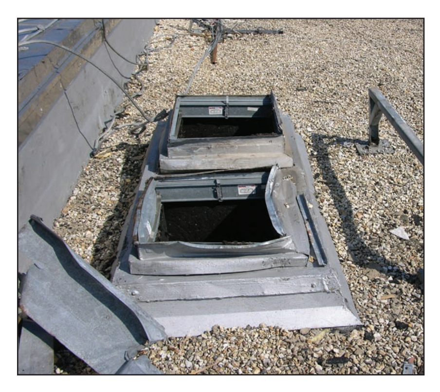
Figure 8-2. GULFPORT, MISSISSIPPI: Winds dislodged roof mounted equipment and created large openings in the roof system.

Roof systems can also fail if roof-mounted equipment is damaged or dislodged by high winds. During Hurricane Katrina, loss of mechanical equipment caused the majority of water damage that was observed in several buildings. In some of those buildings, structural roof damage itself was quite minimal yet the buildings experienced extensive water damage.