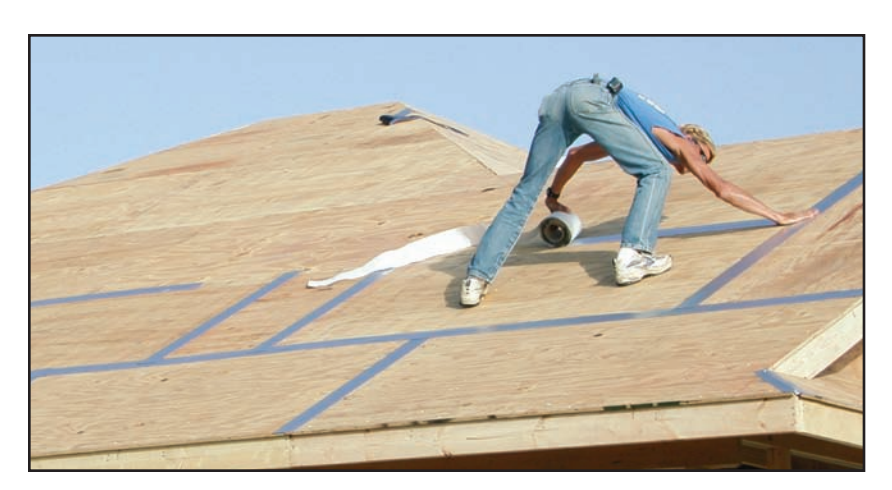
Figure 8-3. Example of an augmented underlayment installation that helps provide a secondary barrier against water intrusion during a storm event.

Asphalt Shingles. The IRC permits the installation of asphalt shingles on continuous sheathing for roofs with slopes as low as 2:12. When this covering is installed on roofs sloped between 2:12 and 4:12, two layers of underlayment are required. Roofs with slopes greater than 4:12 require only one layer of underlayment. Section R301.2.1 requires that asphalt shingles be designed in accordance with Section R905.2.6, which permits asphalt shingles classified using ASTM D 3161 to be installed in areas with basic wind speeds below 110 mph. Areas with wind speeds of 110 mph or higher require "special fastening methods." Special fastening is also required for roof pitches greater than 20:12. Special fastening requires shingles that are classified using ASTM 3161 be considered Class F. Recommendations on the required special fasteners should be attained through the shingle manufacturer.