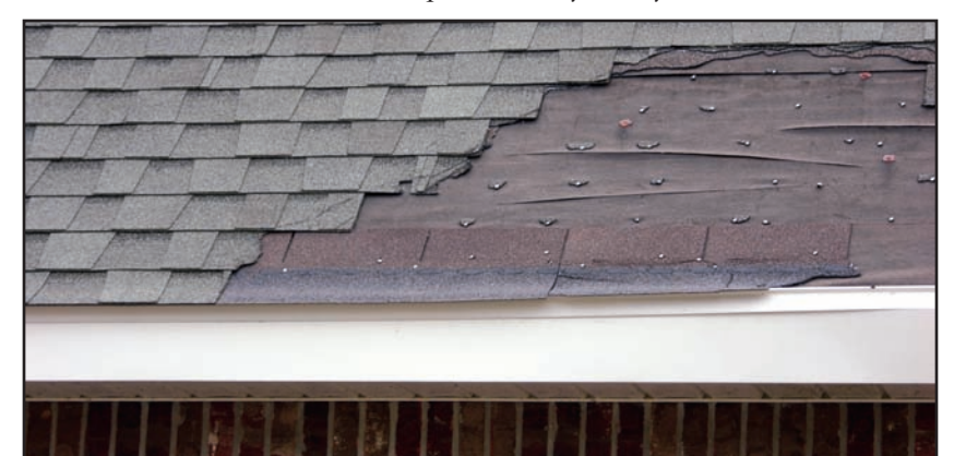
FEMA 499, Technical Fact Sheet No. 20: Asphalt Shingle Roofing for High-Wind Regions, provides guidance on asphalt shingle installations. Many of the recommendations presented are similar to those described in the installation instructions provided by many manufacturers.