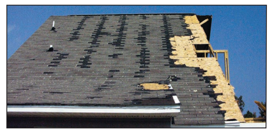
Figure 8-6. Roof failures that resulted from asphalt shingles being installed in a raking fashion.