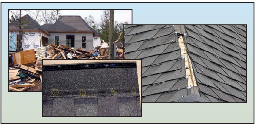
Figure 8-7. Loss of asphalt shingle roofing along hip. Best Practices approaches contained in Technical Fact Sheet No. 20 help prevent this mode of failure.