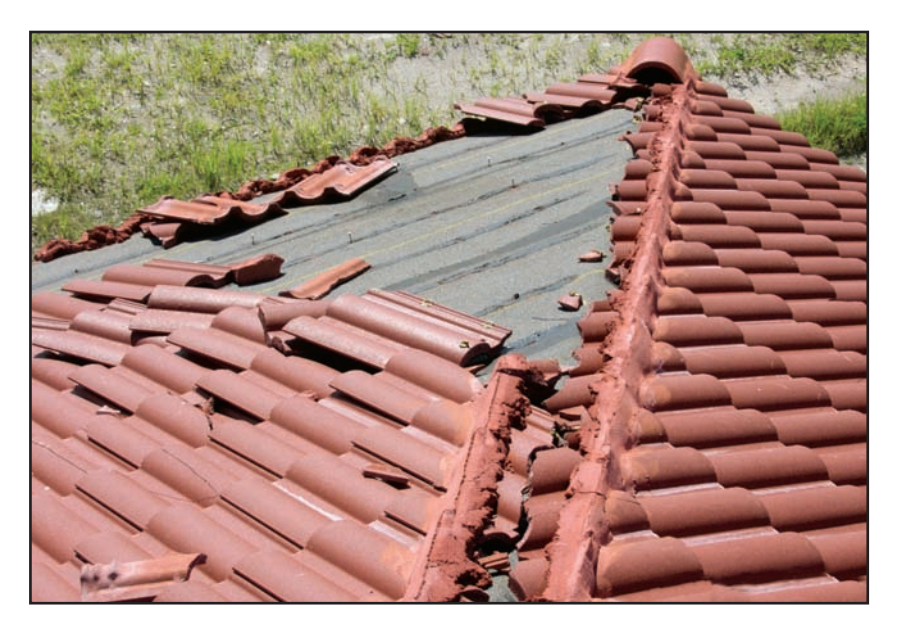
Figure 8-9. Storm damage to a tile roof system.

Wood Shingles and Shakes. Sections 905.7 and 905.8 contain the requirements for wood shingle and shake coverings. Roofing can be installed on solid or spaced sheathing, but solid sheathing is required where ice dams or low temperatures require an ice shield. Wood shake installations differ from wood shingle installations particularly in their underlayment and rake installations. Due to the irregular surface of wood shakes, an interlayment layer of 30-pound roofing felt is required to improve weather tightness. This interlayment layer is applied between each course.