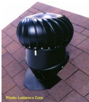
Wind Turbine or “Whirlybird” Typically – 12” circle or 122 sq. in.