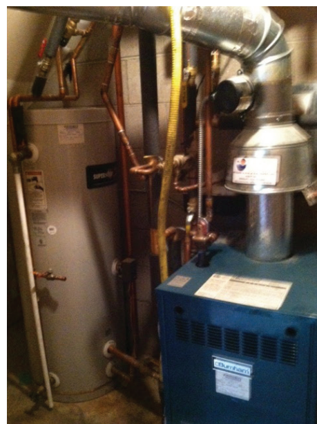
An indirect water heater: the blue boiler heats water in a pipe that runs in a coil through the storage tank for both space and domestic hot water heating.

Indirect water heaters consist of a single boiler, a stand-alone storage tank for both domestic hot water and space heating, piping, and other associated components. Water is run in a piping loop from the boiler (where it is heated) through a coil in the storage tank. In the storage tank the coil of water exchanges its heat with the surrounding storage water before returning to the boiler. Domestic hot water is usually controlled as its own 'zone' of the house. In warm weather, the boiler is used only to produce domestic hot water. In cold weather, very little extra energy is used