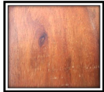
Plate 12: Cordia millenii