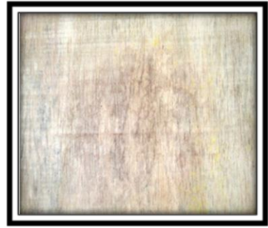
Plate 6: Ceiba pentandra