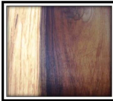
Plate 11: Mansonia altissima