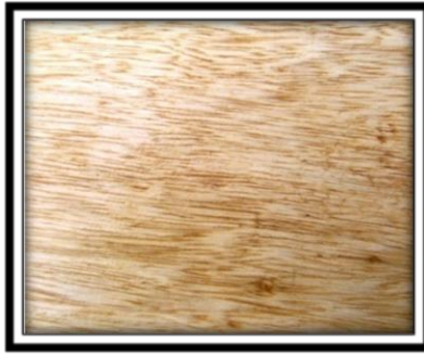
Plate 5: Terminalia superba