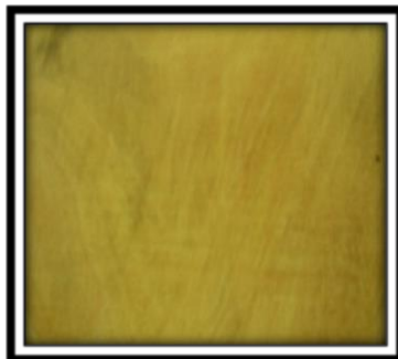
Plate 13: Nauclea diderrichi