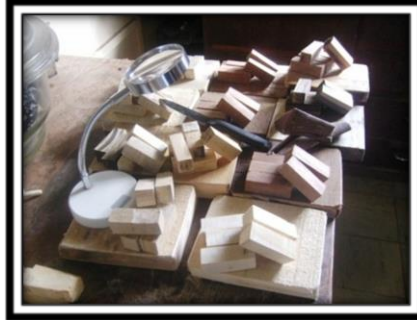
Plate 1: Wood samples at FRIN laboratory