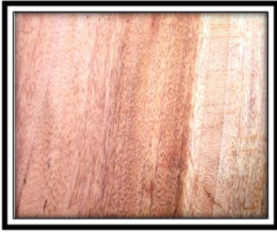
Plate 4: Mitragyna ciliata )