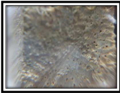
Plate 2: Solitary and diffuse porous