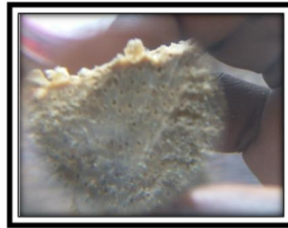
Plate 3: Solitary pores