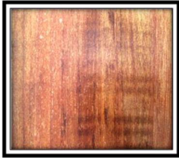
Plate 7: Sterculia rhinopetala