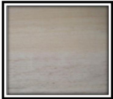
Plate 10: Triplochiton sceroxylon