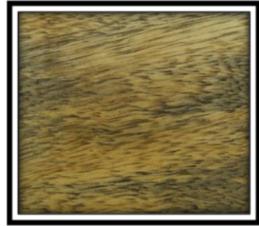
Plate 9: Milicia excelsa