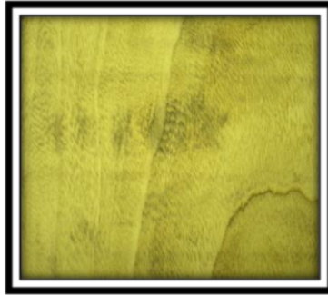
Plate 8: Terminalia ivorensis