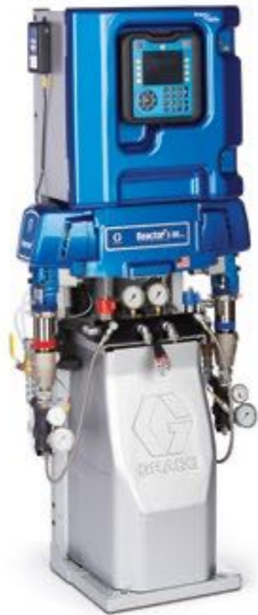
Reactor 2 E-30

The smaller footprint will free-up space in your trailer or rig. Base, Standard or Elite packages available.