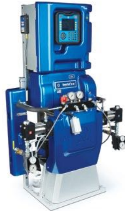
Reactor 2 H-30

The industries most popular system. Ideal for residential spray foam applications. Smaller footprint when compared to other spray systems.