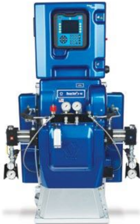
Reactor 2 H-40

High-production hydraulic systems have the dependability you need along with being robust, durable and is one of the longest life spray systems available. Reduce your downtime with longer periods in between required maintenance. Capable of extremely high duty cycles for increased daily productivity. Base, Standard or Elite packages available.