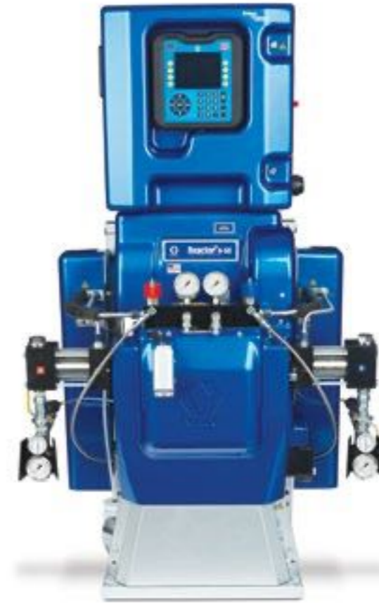
Reactor 2 H-50

Ideal for large commercial spray foam and roofing applications or for OEM high duty cycle applications.