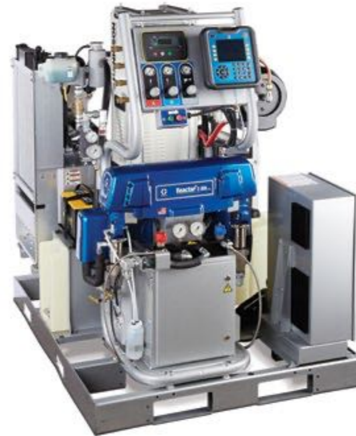
Reactor 2 E-30i

With it's new patented design you'll have improved heating capacity allowing you to adjust temperatures quickly to minimize downtime during recirc.