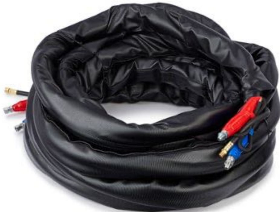
Xtreme-Wrap® Scuff Guard

Available in Xtreme-Wrap, bluemesh scuff or no scuff.