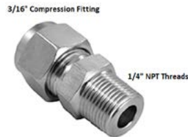
Figure 5: Compression Fitting