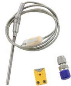
Figure 2: GAC STE101 Kit