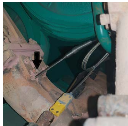
Figure 7: Insert Compression Fitting with Sensor Into Bung

To prevent future problems, examine protection tubes for excessive corrosion, wear, oxidation and physical damage. Protection tubes exhibiting damage and/or excessive corrosion should be replaced.