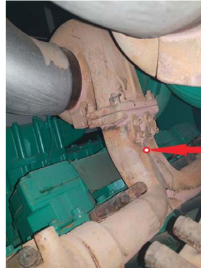
Figure 4: Mark Weld-In Bung Placement