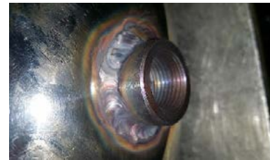
Figure 6: Bung