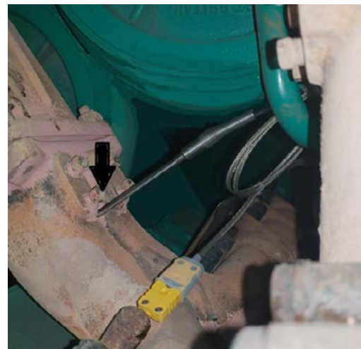
Figure 3: Exhaust Cylinder Merge