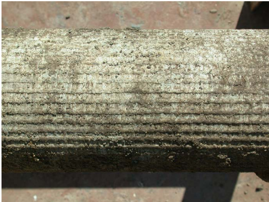
Figure 2: Close-up view of AC pipe Sample X-87 (Lot 10, Shoreline Drive) in the as-received condition, showing adhered dirt and sand and the heavy waffle pattern on the sample external diameter surface.