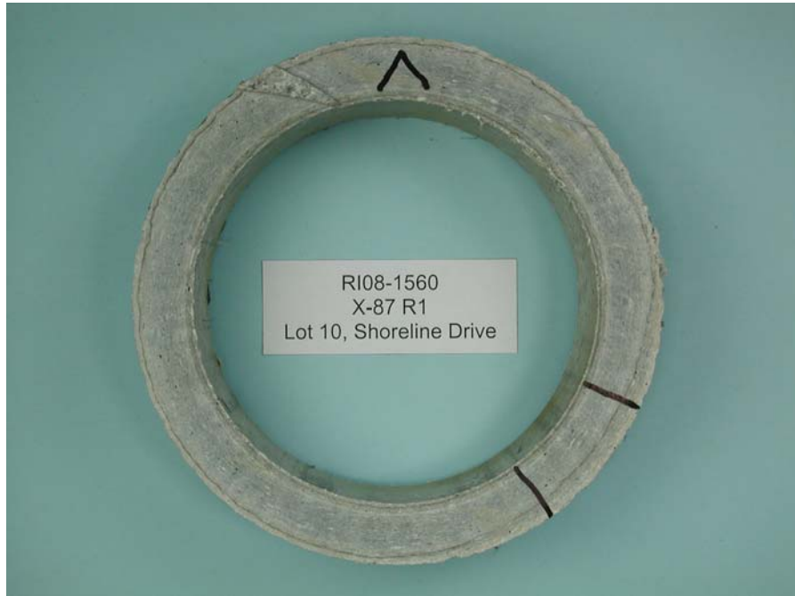
Figure 7: View of end ring section (X-87 R1) from AC pipe Sample X-87 (Lot 10, Shoreline Drive) with markings showing the area to be cut out for further analysis.