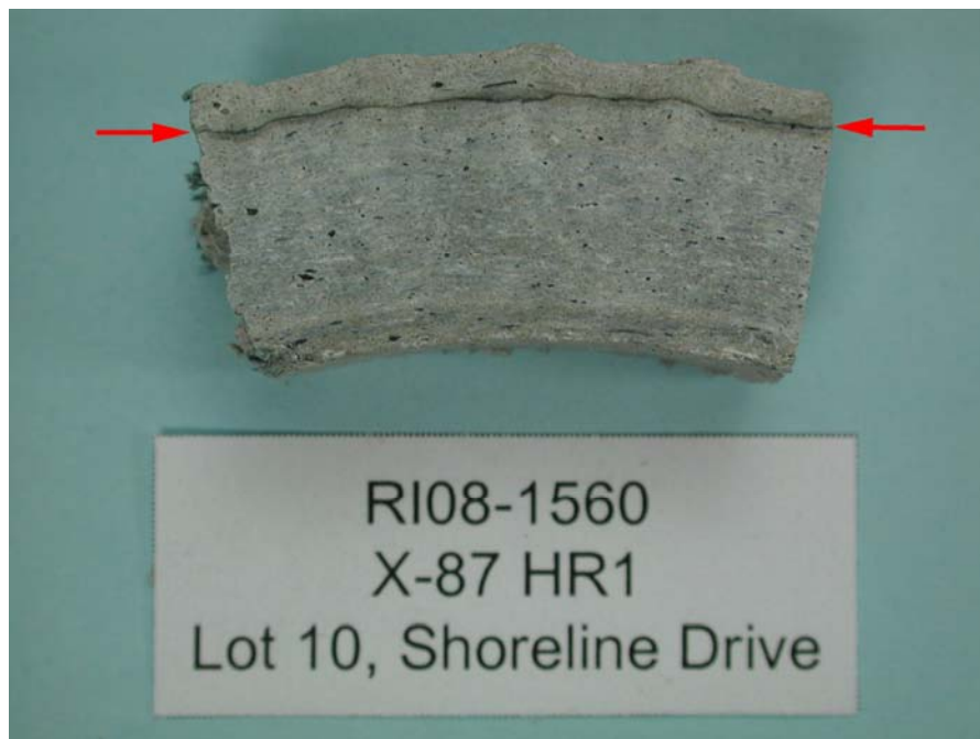
Figure 12: View of Sub-sample X-87 HR1 shown in Figure 10 after removal and polishing (hydrostatic fracture shown at left). On the external diameter surface, leached and sound pipe wall material appeared separated by a distinct leaching front (dark line between arrows).