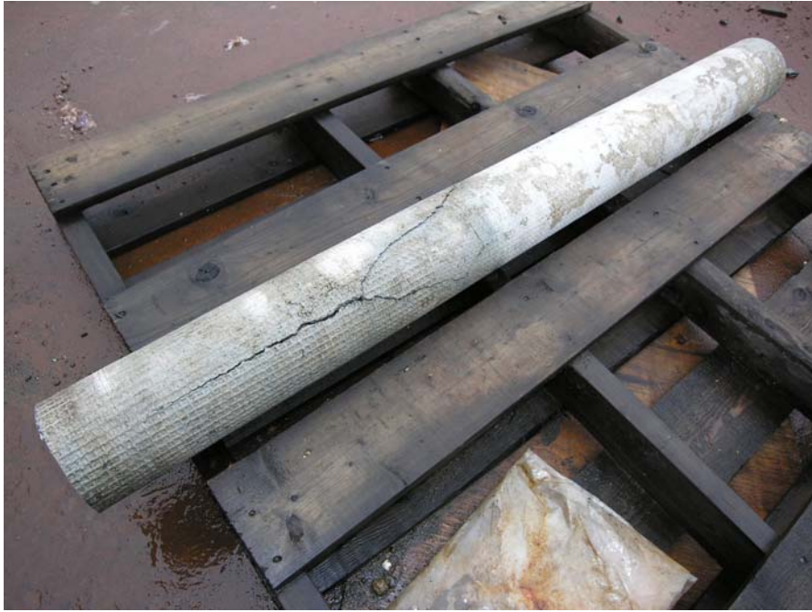
Figure 5: View of the hydrostatic strength fracture of Sample X-87 (Lot 10, Shoreline Drive) showing the longitudinal fracture (middle left) and forked end (middle), typical of hydrostatic pressure fractures observed in previous studies completed by Levelton.