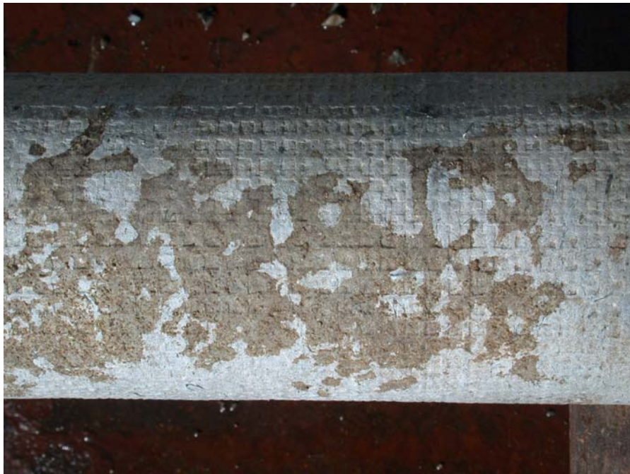
Figure 4: Close-up view of the external diameter surface of AC pipe Sample X-87 after cleaning showing the waffle pattern and an area of brown staining.