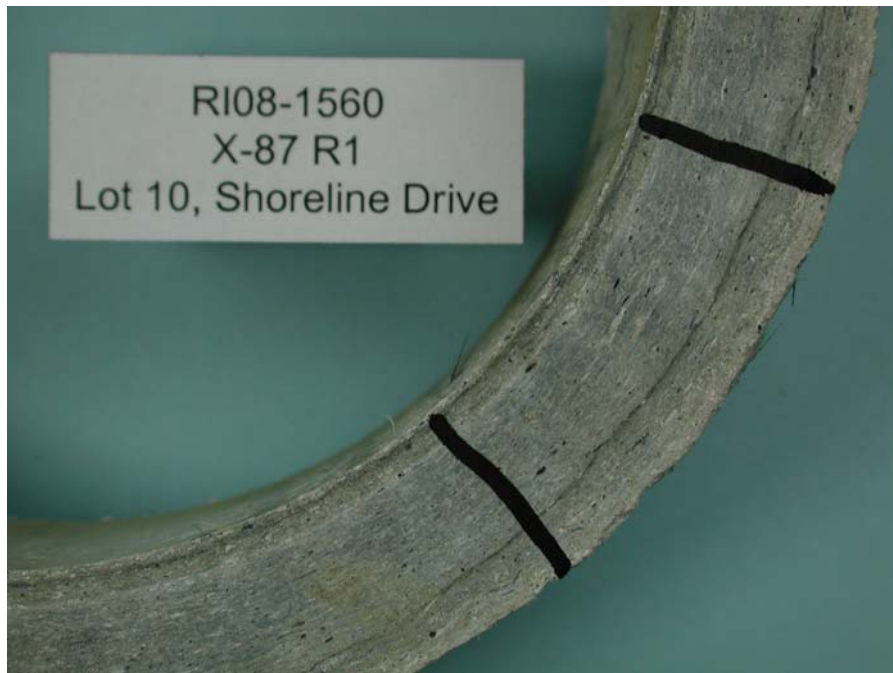
Figure 8: Close-up view of Figure 7 (end ring Section X-87 R1) showing the area marked for removal and further laboratory analysis.