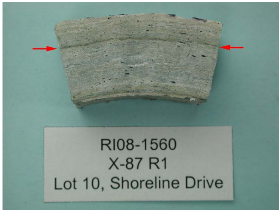
Figure 11: View of Sub-sample X-87 R1 shown in Figure 8 after removal and polishing. On the external diameter surface, leached and sound pipe wall material appeared separated by a distinct leaching front (dark line between arrows).