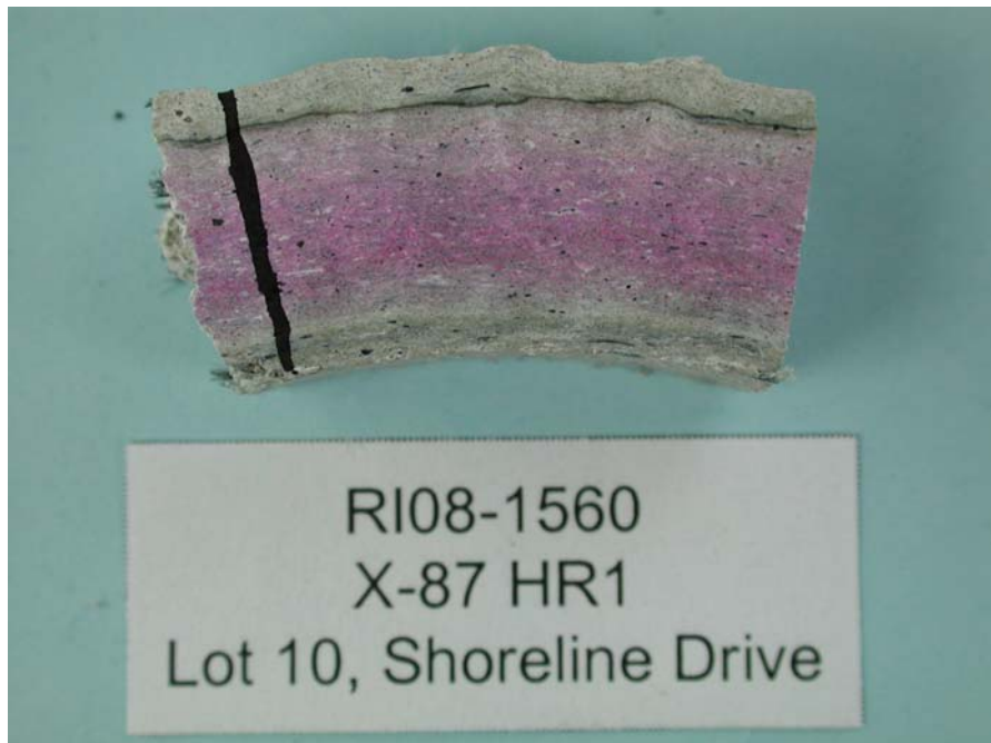
Figure 16: View of Sub-sample X-87 HR1 shown in Figure 14 after polishing, phenolphthalein indicator “staining”, drying and marking for SED/EDS analysis (hydrostatic fracture at left).