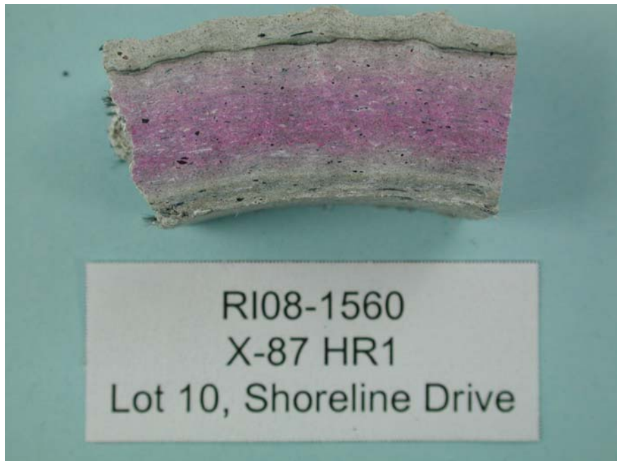
Figure 14: View of Sub-sample X-87 HR1 shown in Figure 12 after polishing and phenolphthalein indicator "staining" (hydrostatic fracture shown at left). The pink colouration indicates a band of unleached (sound) pipe wall.