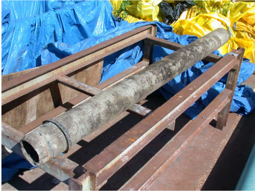
Figure 1: View of AC pipe Sample X-87 (Lot 10, Shoreline Drive) in the as-received condition.