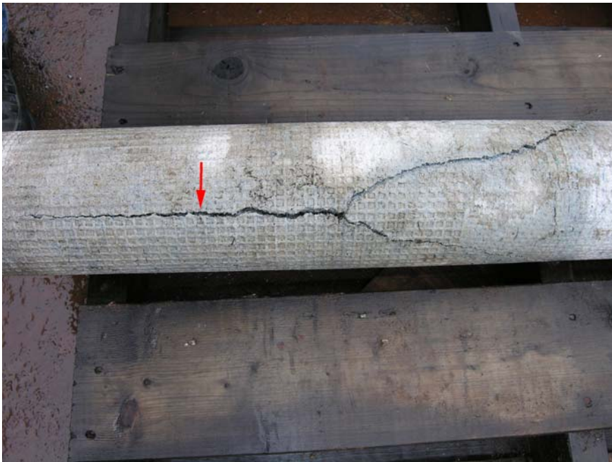
Figure 6: Additional view of the hydrostatic fracture of Sample X-87. The fracture would likely have originated in the longitudinal portion of the fracture shown (indicated by the arrow), which is where the hydrostatic ring section was removed from for further testing.