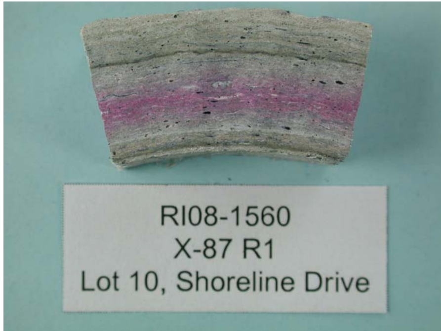
Figure 13: View of Sub-sample X-87 R1 shown in Figure 11 after polishing and phenolphthalein indicator "staining". The pink colouration, caused by the phenolphthalein "staining", indicates a band of unleached (sound) pipe wall.