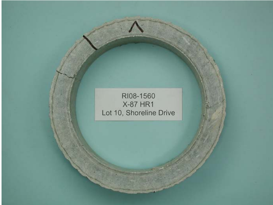
Figure 9: View of hydrostatic ring section (X-87 HR1) from AC pipe Sample X-87 (Lot 10, Shoreline Drive) with markings showing the area to be cut out for further analysis.