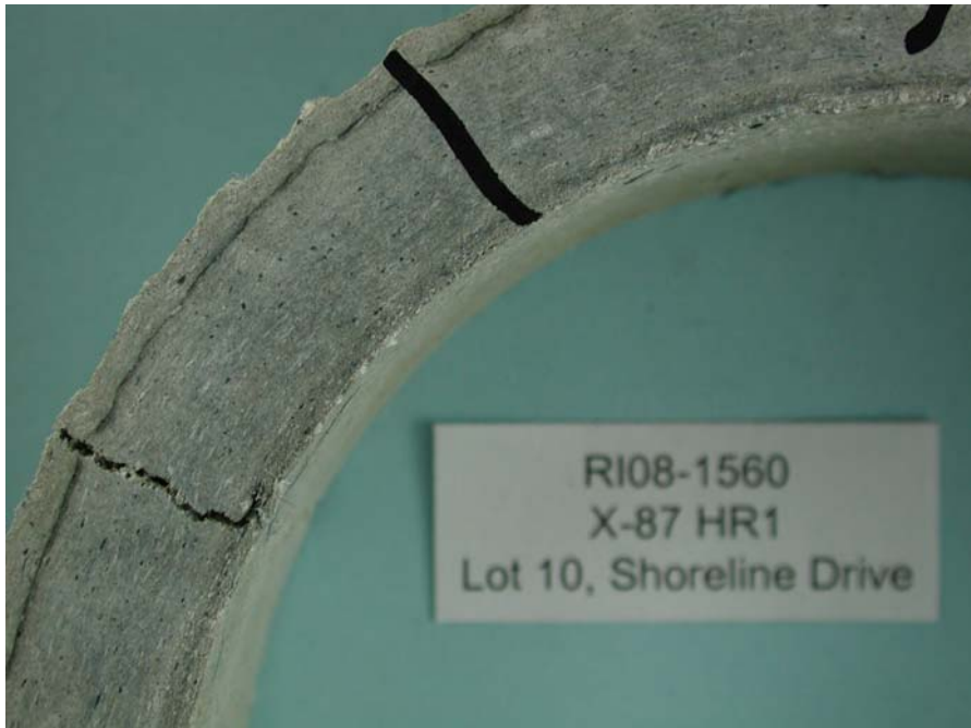
Figure 10: Close-up view of Figure 9 (hydrostatic ring section X-87 HR1) showing the area marked for removal and further laboratory analysis (hydrostatic fracture shown at the left).