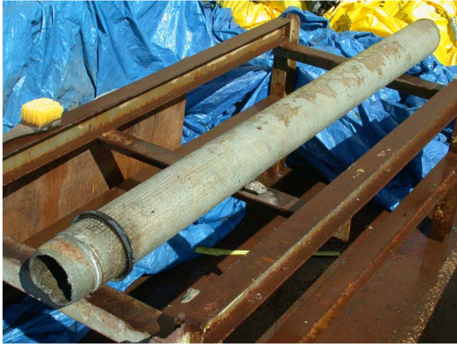
Figure 3: View of AC pipe Sample X-87 (Lot 10, Shoreline Drive) after cleaning showing areas of brown staining on the external diameter surface.