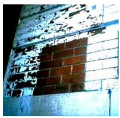
Any cleaning method should be tested before using it on historic masonry.

Identify prior treatments. Previous treatments of the building and its surroundings should be researched and building maintenance records should be obtained, if available. Sometimes if streaked or spotty areas do not seem to get cleaner following an initial cleaning, closer inspection and analysis may be warranted. The discoloration may turn out not to be dirt but the remnant of a water-repellent coating applied long ago which has darkened the surface of the masonry over time. Successful removal may require testing several cleaning agents to find something that will dissolve and remove the coating. Complete removal may not always be possible. Repairs may have been stained to match a dirty building, and cleaning may make these differences apparent. De-icing salts used near the building that have dissolved can migrate into the masonry. Cleaning may draw the salts to the surface, where they will appear as efflorescence (a powdery, white substance), which may require a second treatment to be removed. Allowances for dealing with such unknown factors, any of which can be a potential problem, should be included when investigating cleaning methods and materials. Just as more than one kind of masonry on a historic building may necessitate multiple cleaning approaches, unknown conditions that are encountered may also require additional cleaning treatments.