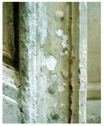
This clear coating has failed stone as it peels.

gutters, or other sources, can cause considerable damage.