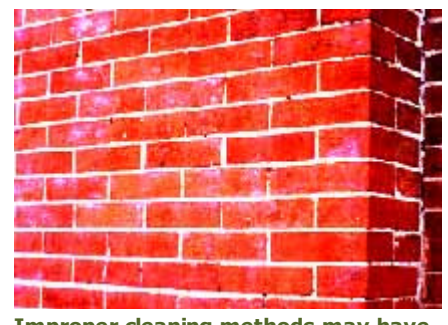
Improper cleaning methods may have been responsible for the formation of

Anti-graffiti or barrier coatings are another type of clear coating--although barrier coatings can also be pigmented--that may be applied to exterior masonry, but they are not formulated primarily as water repellents. The purpose of these coatings is to make it harder for graffiti to stick to a masonry surface and, thus, easier to clean. But, like water-repellent coatings, in most cases the application of anti-graffiti coatings is generally not recommended for historic masonry buildings. These coatings are often quite