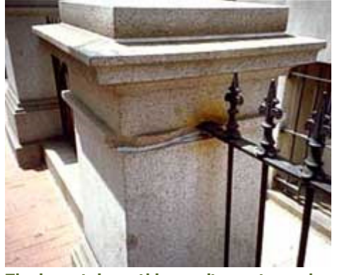
The iron stain on this granite post may be removed by applying a commercial rust-removal product in a poultice.

Some commercial cleaning products and paint removers are specially formulated as a paste or gel that will cling to a vertical surface and remain moist for a longer period of time in order to prolong the action of the chemical on the stain. Pre-mixed poultices are also available as a paste or in powder form needing only the addition of the appropriate liquid. The masonry must be pre-wet before applying an alkaline cleaning agent, but not when using a solvent. Once the stain has been removed, the masonry must be rinsed thoroughly.