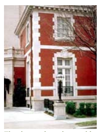
The decorative trim on this brick builing is architectural terra-cotta intended to simulate the limestone foundation.

The construction of the building must be considered when developing a cleaning program because inappropriate cleaning can have a deleterious effect on the masonry as well as on other building materials. The masonry material or materials must be correctly identified. It is sometimes difficult to distinguish one type of stone from another; for example, certain sandstones can be easily confused with limestones. Or, what appears to be natural stone may not be stone at all, but cast stone or concrete. Historically, cast stone and architectural terra cotta were frequently used in combination with natural stone, especially for trim elements or on upper stories of a building where, from a distance, these substitute materials looked like real stone. Other features on historic buildings that appear to be stone, such as decorative cornices, entablatures and window hoods, may not even be masonry, but metal.