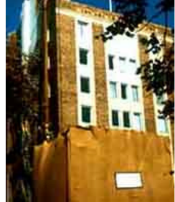
The lower floors of this historic brick and architectural terra-cotta building have been covered during chemical cleaning to protect pedestrians and vehicular traffic from potentially harmful overspray. Photo:

Safety considerations. Possible health dangers of each method selected for the cleaning project must be considered before selecting a cleaning method to avoid harm to the cleaning applicators, and the necessary precautions must be