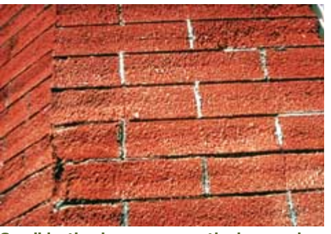
Sandblasting has permanently damaged this brick wall.

Abrasive Blasting. Blasting with abrasive grit or another abrasive material is the most frequently used abrasive method. Sandblasting is most commonly associated with abrasive cleaning. Finely ground silica or glass powder, glass beads, ground garnet, powdered walnut and other ground nut shells, grain hulls, aluminum oxide, plastic particles and even tiny pieces of sponge, are just a few of the other materials that have also been used for abrasive cleaning. Although abrasive blasting is not an appropriate method of cleaning historic masonry, it can be safely used to clean some materials. Finely-powdered walnut shells are