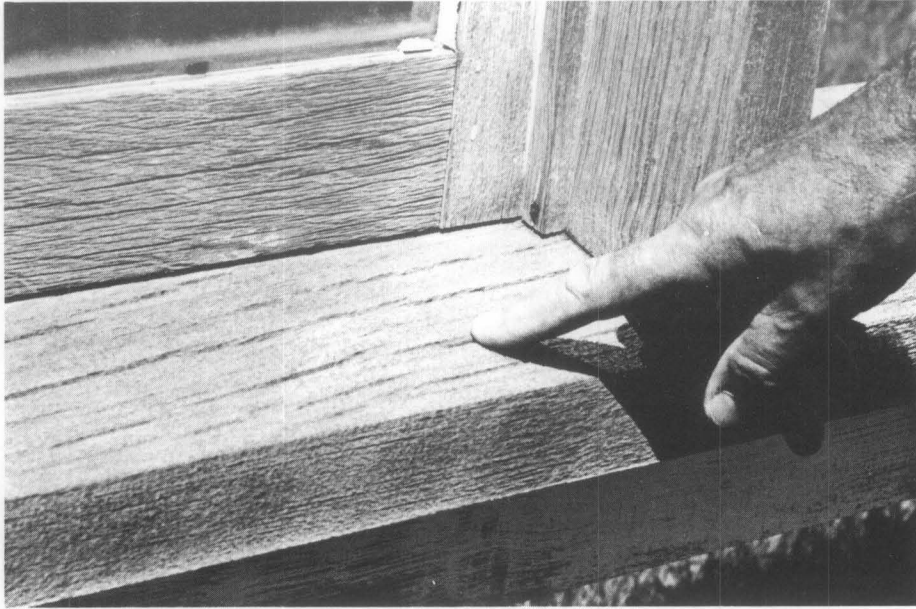
Figure 3. Close-up view of the window unit treated with water-repellent chemical preservative after 20 years' exposure. Condition of millwork is very good.