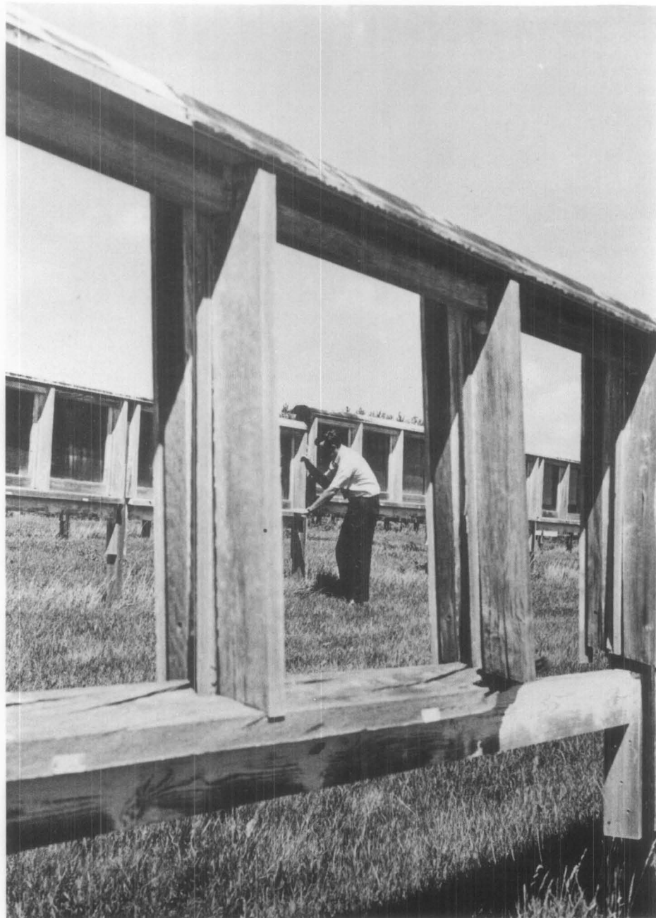
Figure 2. Close-up view of decayed, untreated window frame. Frame fell apart after 6 years' exposure.

Treatment is best done by dipping the wood for 1 to 3 minutes in the solution. If dipping is inconvenient, liberal brush application can be made—paying particular attention to heavy treatment of all board ends and joints. The treated surface can be painted after 2 or 3 days of warm weather. In fact, paint should last longer over the treated surface than over untreated wood.