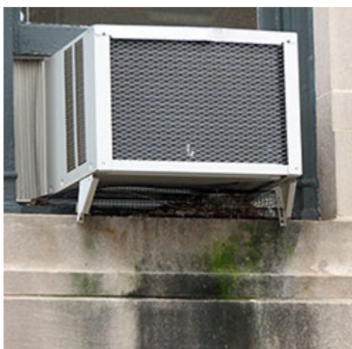
Figure 13. Window air conditioning units can cause damage to surfaces below when condensation drips in an uncontrolled manner. Drip extension tubes can sometimes be added to direct the discharge.

Many contractors are very proficient in using modern construction methods and materials; however, they may not have the experience or skill required to carry out maintenance on historic buildings. The following are tips to use when selecting a contractor to work on your historic building: