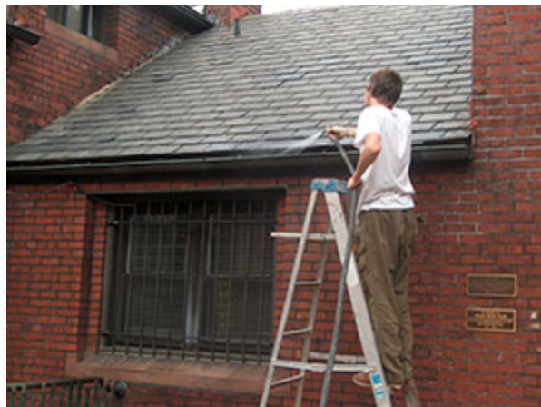
Figure 3. Keeping gutters clean of debris can be one of the most important cyclical maintenance activities. On this small one-story addition, a garden hose is being used to flush out the trough to ensure that the gutter and downspouts are unobstructed. Gutters on most small and medium size buildings can be reached with an extension ladder and a garden hose.