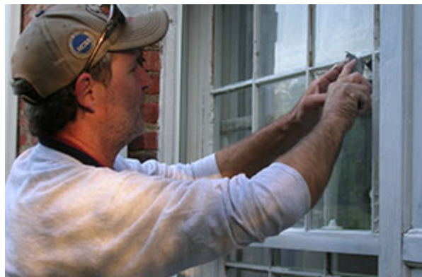
Figure 11. Glazing putty should be maintained in sound condition to prevent unwanted air infiltration and water damage. New glazing putty should be pulled tight to the glass and edge of the wood, creating a clean bevel that matches the historic glazing