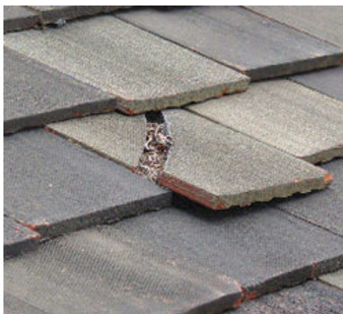
Figure 4. Damage to roofs often requires immediate attention. As a temporary measure, this damaged roof tile could be replaced with a brown aluminum sheet wedged between the existing tiles.