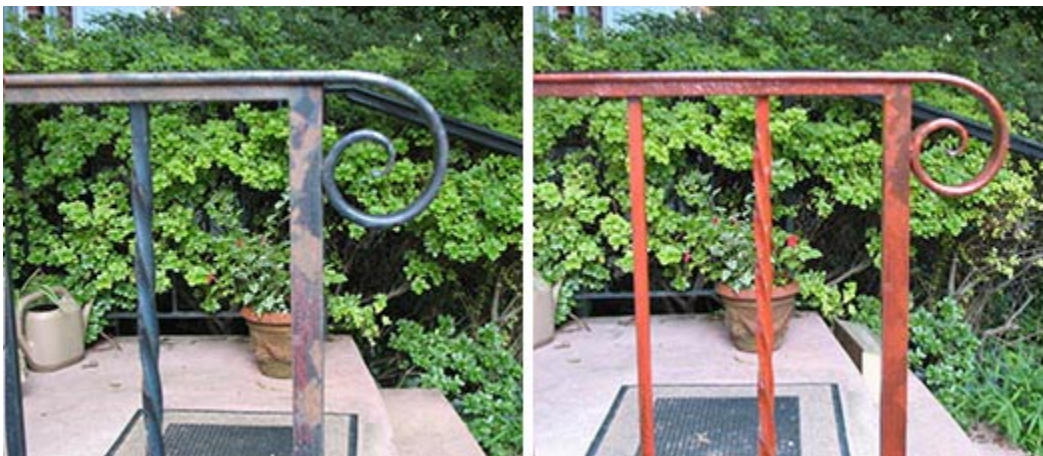
Figure 15. Metal projecting elements on a building, such as sign armatures and railings, are easily subject to rust and decay. Proper surface preparation to remove rust is essential. Special metal primers and topcoats should be use