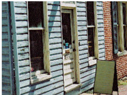
Figure 8. The paint on the siding of this south-facing wall needs to be scraped, sanded, primed and repainted. Postponing such work will lead to further paint failure, require greater preparatory costs, and could even result in the need to replace some siding.