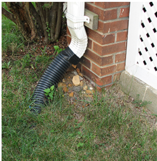
Figure 17. Extending downspouts at their base is one of the basic steps to reduce dampness in basements, crawl spaces and around foundations. Extensions should be buried, if possible, for aesthetics, ease of lawn care, and to avoid creating a tripping hazard.

Installation of caulks and sealants often can be undertaken by site personnel. For large and more complex projects, a contractor experienced in sealant installation may be needed. In either case, the sealant manufacturer should be consulted on proper sealant selection, preparation, and installation procedures.