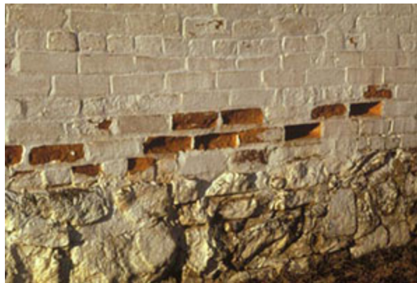
Figure 10. Repointing of masonry should usually be approached as repair rather than maintenance work in part because of the need for a skilled mason familiar with historic mortar. In this case, a moisture condition was not corrected and the use of a waterproof coating and off-the-shelf Portland cement mortar trapped water and resulted in further damage to these 19th century bricks.