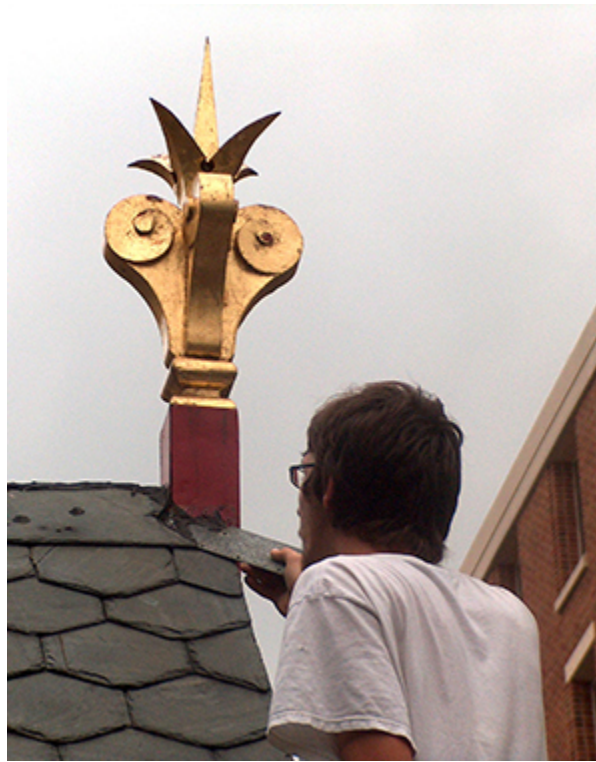
Figure 5. The use of a sealant to close an exposed joint is not always an effective long-term solution. Where this decorative wood element connects to the slate roof, the sealant has failed within a short time and a proper metal flashing collar is being fitted instead.