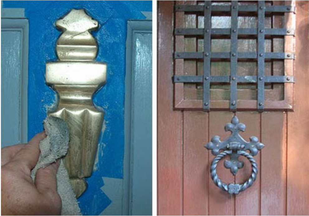
Figure 1. Maintenance involves selecting the proper treatment and protecting adjacent surfaces. Using painter's tape to mask around a brass doorknocker protects the painted door surface from damage when polishing with chemical compounds. On the other hand, hardware with a patinated finish was not intended to be polished and should simply be cleaned with a damp cloth.

Exterior building components, such as roofs, walls, openings, projections, and foundations, were often constructed with a variety of functional features, such as overhangs, trim pieces, drip edges, ventilated cavities, and painted surfaces, to protect against water infiltration, ultraviolet deterioration, air infiltration, and pest infestation. Construction assemblies and joints between materials allow for expansion and contraction and the diffusion of moisture vapor, while keeping water from penetrating the building envelope. Older buildings use such features effectively and care must be taken to retain them, avoiding the temptation to reduce air infiltration or otherwise alter them.