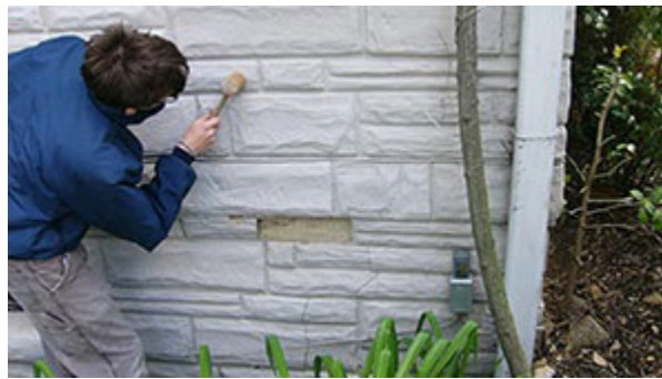
Figure 6. Stucco applied to an exterior wall or foundation was intended to function as a watertight surface. Unless maintained, rainwater will penetrate open joints and cracks that may occur over time. A spa lied section of stucco indicates some damage has occurred and a wooden mallet is being used to tap the surface to determine whether the immediate stucco has lost adhesion.