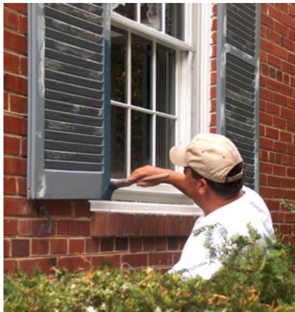
Figure 12. Good surface preparation is essential for long lasting paint. Scraping loose paint, filling nail holes and cracks, sanding, and wiping with a damp cloth prior to repainting are all important steps whether touching up small areas or repainting an entire feature. Always use a manufacturer's best quality paint. Windows and shutters may need repainting every five to seven years, depending on exposure and climate.