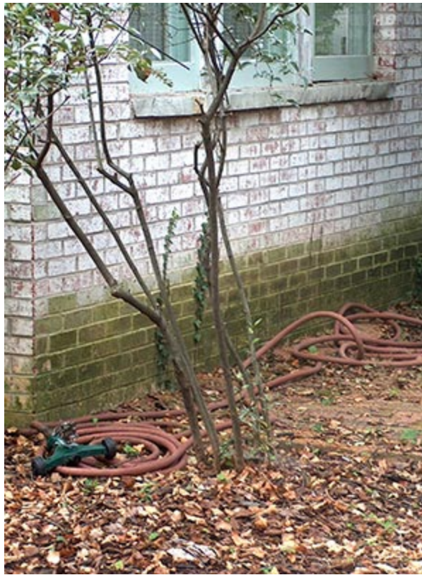
Figure 16. This chronically wet area has a mildew bloom brought on by heat generated from the air-conditioning condenser unit. The dampness could be caused by a clogged roof gutter, improper grading, or a leaking hose bibb.