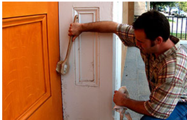
Figure 9. To help extend a repainting cycle, dirt and spider webs should be removed before permanent staining occurs. In this case, a natural bristle brush and a soft damp cloth are being used to remove insect debris and refresh the surface appearance.