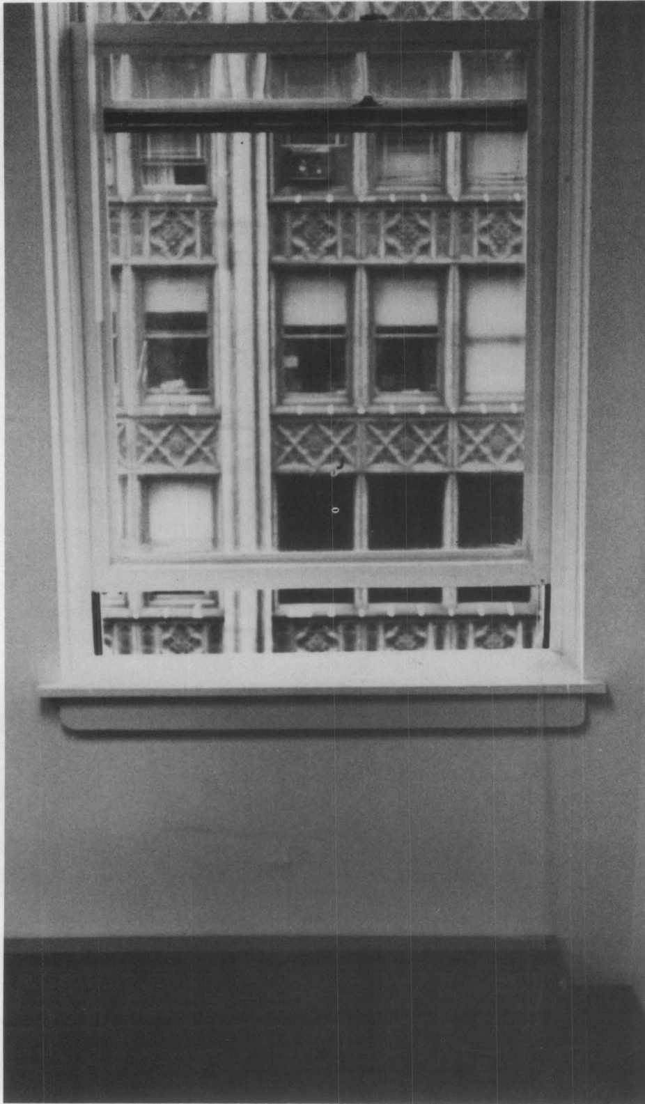
Figure 3. View of the window with the lower sash partially raised following completion of the work. Due to the large size of the sash, the small flat aluminum trim piece covering the spacer had little noticeable effect on the appearance of the windows as viewed from the typical office area.

The primary seal for the insulating unit was then created by applying an electrical charge for about 5 to 10 minutes through the two copper wires. The wire-resistant heating melted the butyl compound on both sides of the spacer since the aluminum spacer easily conducted the heat generated by the wires to the polyisobutylene strip on the opposite face. As a secondary seal to retard moisture collection between the glass and help secure the new glass in the sash, a silicone compound was applied in the space between the wood frame, the old glass and the edge of the new glass and the metal spacer (see figure 2).