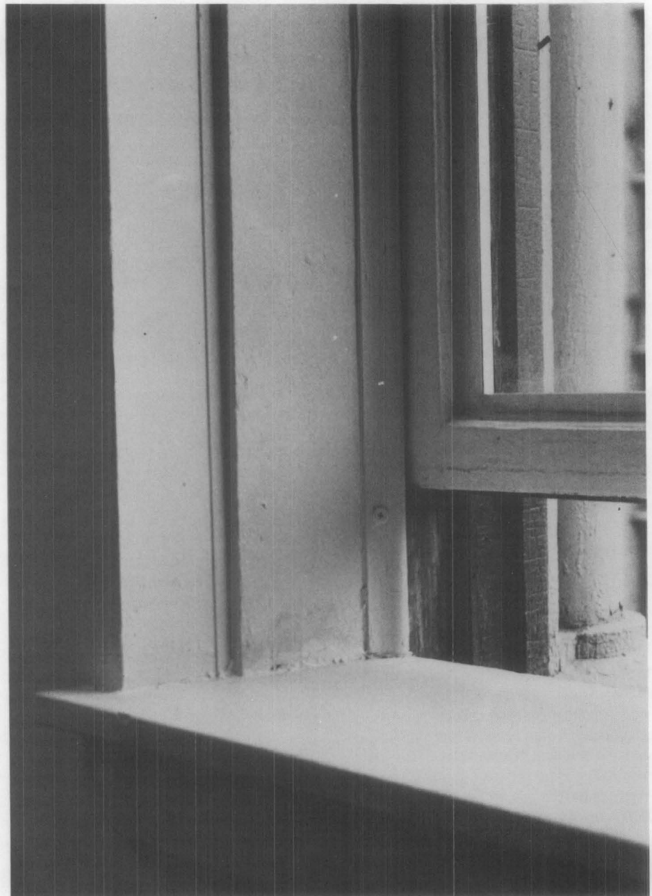
Figure 1. Since the metal spacer placed between the glass sheets is set slightly off the edges of the rails and stiles, the retrofitted insulating unit reduces the historic glass exposure by about 1/2" along all sides. This change on large windows is hardly noticeable particularly once the flat trim piece is glued in place.

Modification of the window sash was accomplished off site. Each window was tagged, working one floor at a time, prior to shipment to a shop facility nearby. Once in the shop, necessary sash repairs were made, loose paint scraped off, and the glass on the inside surface carefully cleaned.