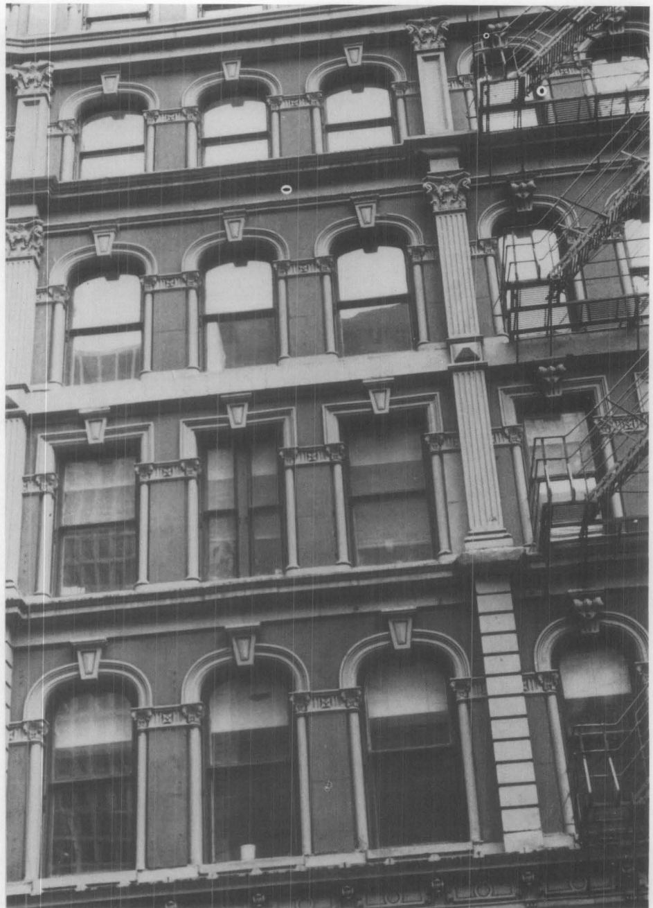
Figure 4. View of the windows on floors 3 thru 6 shows that the technique used for creating sealed insulating glass units in the existing wooden sash had no noticeable impact on the historic appearance of the windows as seen from the street below.

Attractive cost savings over all new sealed units can be realized with this retrofit system, particularly when dealing with arched top sash or windows that vary in size. There are though certain obvious limitations. Where the interior moldings around the inside edges of the rails and stiles are decorative, the manner in which the additional sheet of glass is installed would obscure such detailing. With multipane sash with typical muntin sizes, the encroachment onto