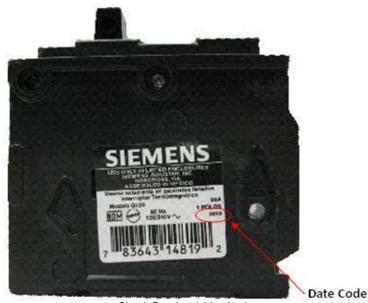
Circuit Breaker (side view)